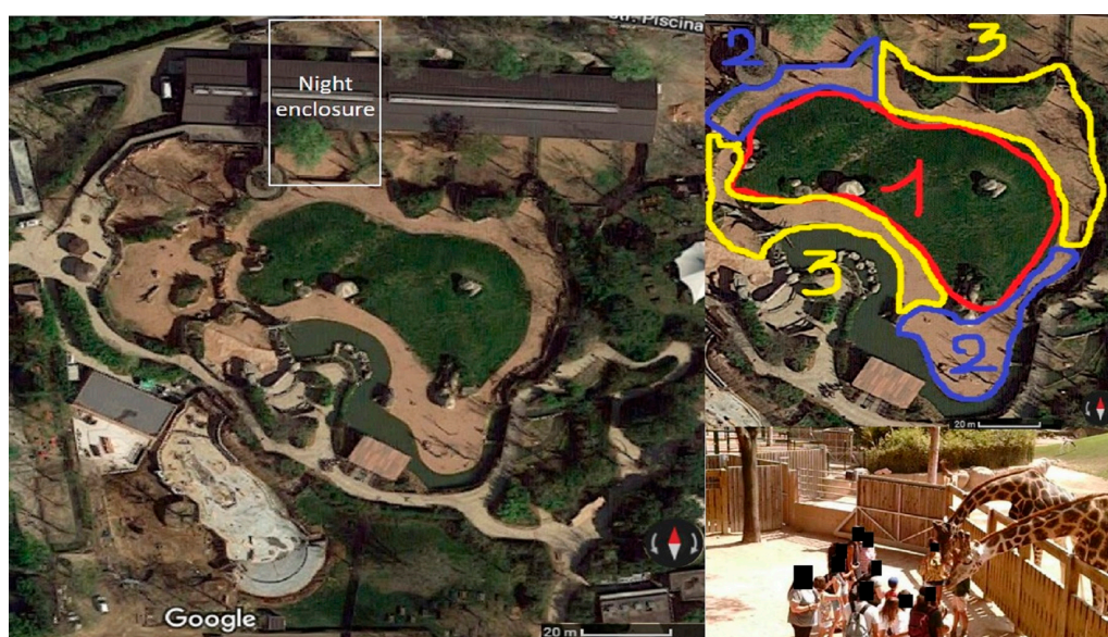
Figure 1. The giraffes' enclosure: on the left—airial view with the night enclosure in the grey rectangle; on the right, top—the zones used for space use analysis; on the right, bottom: a picture of an actual interaction.

The giraffes' overall enclosure consists of a night enclosure and an adjacent day exhibit, divided by a \pm 2.5 m high fence with a gate (Figure 1). The night enclosure consists of two straw bedded ( \pm 3 m \times \pm 1.5 m) indoor stalls and a 260 m 2 outdoor area. The day enclosure (3600 m 2 approximately) is a naturalistic mixed-species exhibit, housing the four giraffes, Mohr gazelles ( Nanger dama ), Thomson's gazelle ( Eudorcas thomsonii ), waterbucks ( Kobus ellipsiprymnus ), blesboks ( Damaliscus pygargus phillipsi ), impalas ( Aepyceros melampus ), ostriches ( Struthio camelus ), and several other bird species.