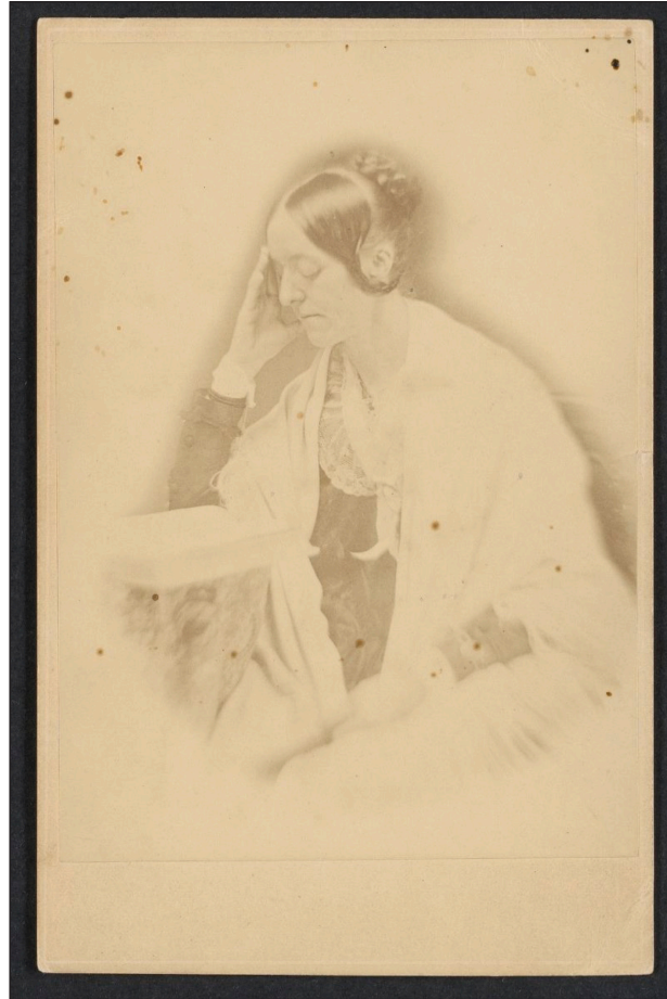
Fig. 1: Margaret Fuller in 1846, before leaving for Europe

her friends and colleagues mobilized in order to deal with and arrange her papers and documents, both the ones they possessed and, more interestingly, those they did not. In this article I explore the space created by the ‘if’ (‘if we cannot find her work’) and the ‘in case’ (‘in case that shall be found’) mentioned in the letter by Greeley, as indicative of the possibilities and doubts inherent in any archival work. I would like to ponder on the conditional origins of Fuller’s archive, both the material archive of her papers and the discursive space generated by uncertainty, unrecovered objects, and scattered remnants. I believe that the imaginative and possibilistic space created by ‘if’ and ‘in case’ is at the origin of the archival impulse and, in this specific case, is what guided the creation of Fuller’s archive in its various instantiations.