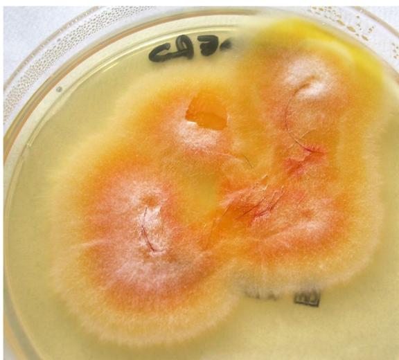
Fig. 2 Culture of the specimen revealed the presence of M. canis colonies

Therapy was started with oral griseofulvin (20 mg/kg/day) with a 2 daily tioconazole cream application. The lesions were also treated with iodized alcohol. At 15-day intervals, the child was subjected to objective examination, including culture tests. The patient was treated for two months in total with both medications and iodized alcohol. After this period of treatment, the first negativization of the culture for M. canis was observed. However, 15 days later at the end of treatment, in the area of the lesions, where hair regrowth was observed, the infant patient presented with a single vesicle with growth of M. canis on culture. Oral treatment with griseofulvin (20 mg/kg/day) was administered for one month. After this period, all scalp lesions were completely healed and cultures resulted negative for dermatophytes. After 3 months of follow-up, no recurrence was observed (Additional file 1).