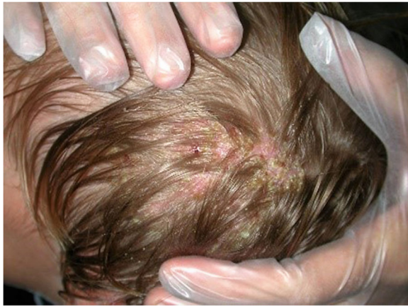
Fig. 1 A 12 month-old male infant presented a history of erythematous scalp lesions combined with hair loss

Therapy was started with oral griseofulvin (20 mg/kg/day) with a 2 daily tioconazole cream application. The lesions were also treated with iodized alcohol. At 15-day intervals, the child was subjected to objective examination, including culture tests. The patient was treated for two months in total with both medications and iodized alcohol. After this period of treatment, the first negativization of the culture for M. canis was observed. However, 15 days later at the end of treatment, in the area of the lesions, where hair regrowth was observed, the infant patient presented with a single vesicle with growth of M. canis on culture. Oral treatment with griseofulvin (20 mg/kg/day) was administered for one month. After this period, all scalp lesions were completely healed and cultures resulted negative for dermatophytes. After 3 months of follow-up, no recurrence was observed (Additional file 1).