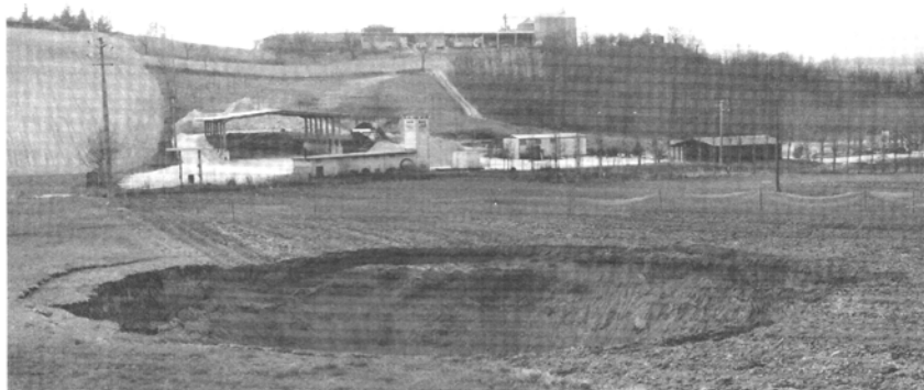
Figure 1 This sinkhole originated at the surface in connection to the inrush events in the quarry drifts.

to analyze groundwater table variations relative to rainfall. Finally, a weir equipped with a digital data logger placed close to the point of the inrush continuously measured the level, the temperature, and the electrical conductivity of the water coming from the karst system (Bonetto et al., 2007). At present, water is collected in basins and pumped outside the quarry to stabilize the groundwater table and carry on mining operations in the higher quarry panels. Unfortunately, due to the high values of TDS, electrical conductivity, and sulphates, the water is not suitable for irrigation and so is reintroduced into the surface drainage pattern.