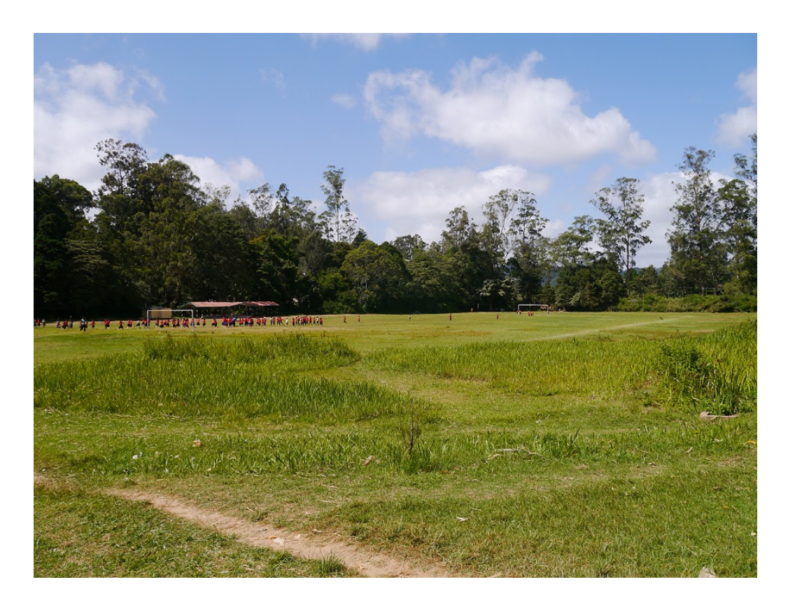
Figure 2: Dawson Mwanyumba Stadium in Wundanyi village is a former wetland that was desiccated by planting of eucalyptus trees to its margins.

To summarize, the general local people's framing of the eucalyptus problem focuses, on the one hand, on the negative impacts of the eucalyptus on local water resources and thus people's livelihoods and, on the other hand, on the loss of indigenous forests and associated cultural values due to exotic tree planting. Local people also recognize the economic benefits of eucalyptus, but claim that the plantations should not harm water resources and that the sharing of benefits should be equal.