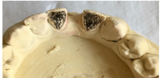
Figure 2: The preparation edges were drawn on the model cast.

The diagnostic cast was waxed to model cast to assess the size and morphology of mandibular incisors. The preparation edges were drawn on the model cast and then reported on teeth limited only at enamel boundaries (Figure 2). The mandibular right lateral incisor and left central incisor teeth were prepared. 1mm supragingival reduction extending to the centre of the interproximal contact, with an incisal finish line 2mm short of the incisal edge and 0,5-mm lingual reduction of the enamel.