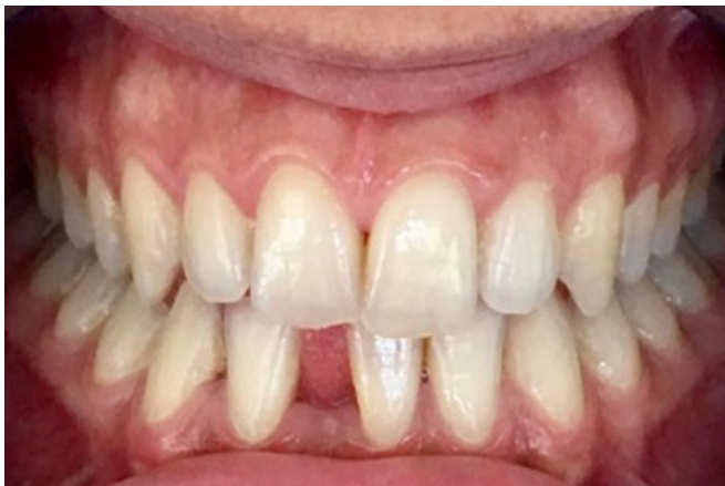
Figure 1: Preliminary intraoral image of the case. (Patient had congenitally missing mandibular right central incisor).

A 17-year-old female presented to the Faculty of Dentistry Gazi University Ankara, displeased with her smile. She had congenitally missing mandibular right central incisor (Figure 1). After clinical examination, radiographs, photographs, study casts were performed. Periodontal conditions, presence of caries, occlusal interferences, smile, esthetics, and facial symmetry were appreciated. After the evaluation, the RBFDP was designed with a copy milling system to maintain the patient's aesthetic and dental unity. The whole design was made with IPS E-max press.