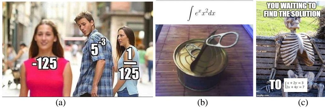
Figure 2: Examples of mathematical memes

within assiduously frequented thematic groups on social media like Facebook or Instagram, which act as veritable and spontaneous communities of practice, where knowledge is shared in a process of collective learning [8]. In this part of the workshop, we will share information about these thematic groups, and use the triple-s construct exposed above to unpack together the layered meanings of some selected examples picked within these groups, created by teachers (the first author) or by students during teaching experiments. Here below we provide examples of these three categories, with the aforesaid analysis.