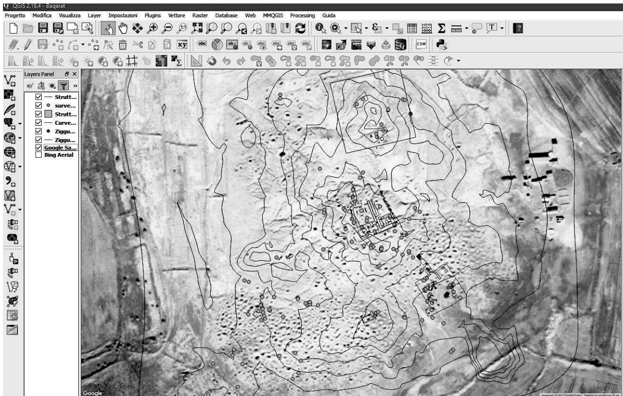
Fig. 3. TB1, distribution of baked bricks on the surface (2016, Italian expedition CRAST).