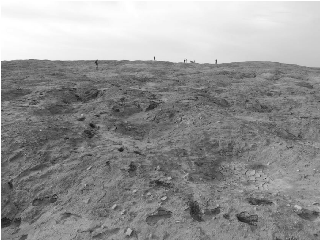
Fig. 13. View of TB10 surface, from the south-west (2015).