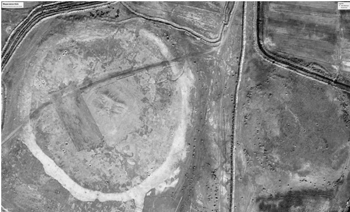
Fig. 10. TB7, satellite image.