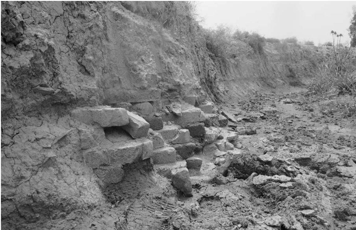
Fig. 9. Brick wall cut by a modern water channel near TB5 (Italian expedition CRAST, 2018).