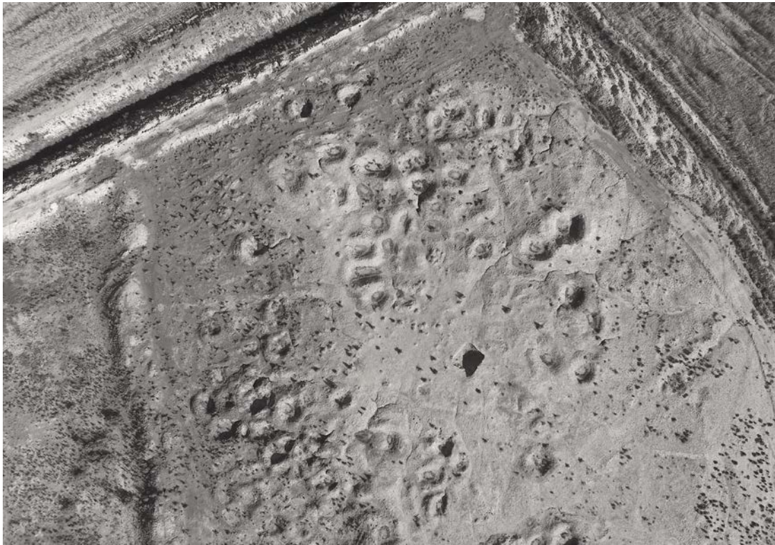
Fig. 7. TB4, looting holes (drone image, 2016: Italian expedition CRAFT).