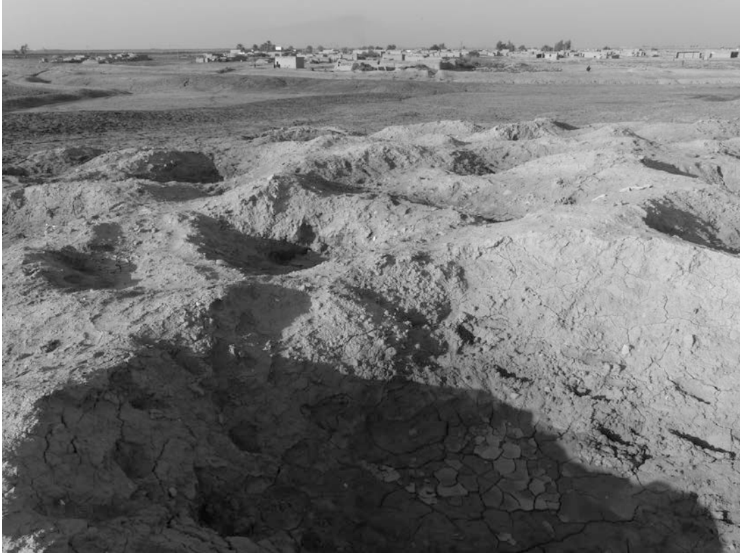
Fig. 12. View of TB9 surface, from the south (2015).