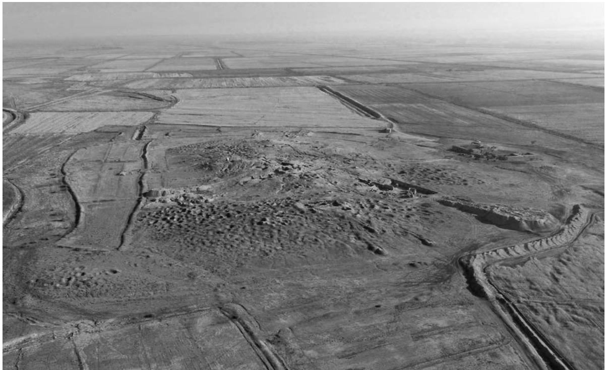
Fig. 2. General view of Tell Baqarat 1 (TB1), from SW (Italian expedition CRAST).