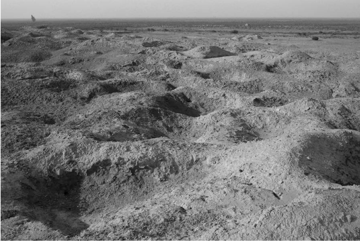
Fig. 5. TB1, surface of the western part of the tell (2015).