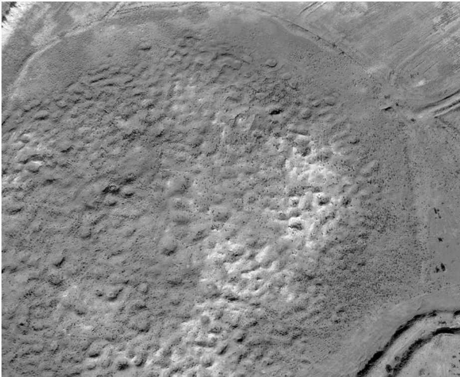
Fig. 6. TB2, after looting (drone image, 2016: Italian expedition CRAFT).