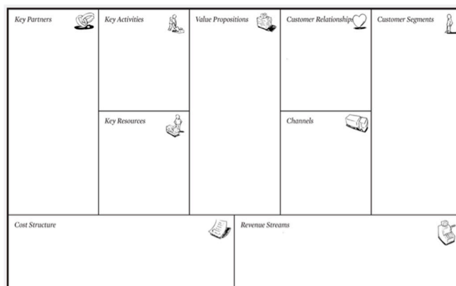
Figure 2. The Business Model Canvas (BMC).

area. Consisting of different blocks, including value propositions, key resources, key activities, key partners, customer segments, customer relationships, channels, the cost structure, and revenue streams, BMC fully covers the business offer. We disregarded cost structure and revenue streams because the data collected only apply to the price of the food offer, excluding the cost structure (see Figure 2).