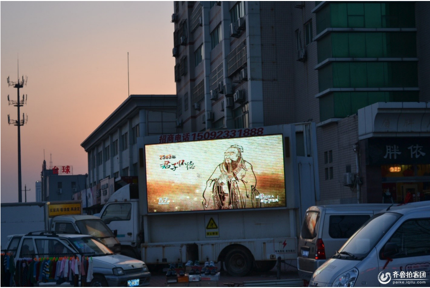
Fig. 2: A truck in the traffic: “The Master said: the superior men thinks of virtue, the small man thinks of comfort...”