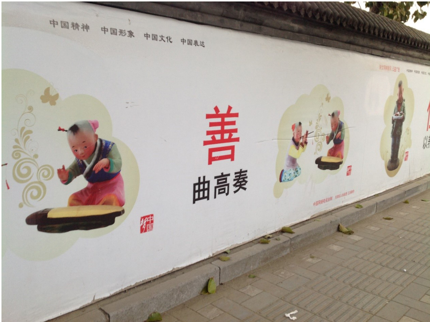
Fig. 1: Praising shan (善), the benevolence