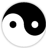
Fig. 1 Yang Spring

A gusty wind cannot last all morning, and a sudden downpour cannot last all day. Who is it that produces these? Heaven and Earth. If even Heaven and Earth cannot go on forever, much less can the human being. That is why one follows the Way.