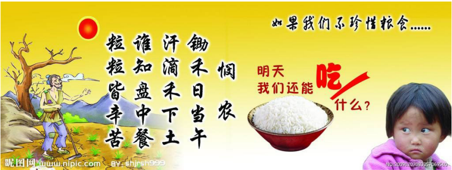
Fig. 3: Using Tang poetry during the ‘Operation Empty Plate’