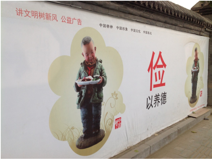
Fig. 4: Jian (俭), frugality: Frugality feeds Virtue