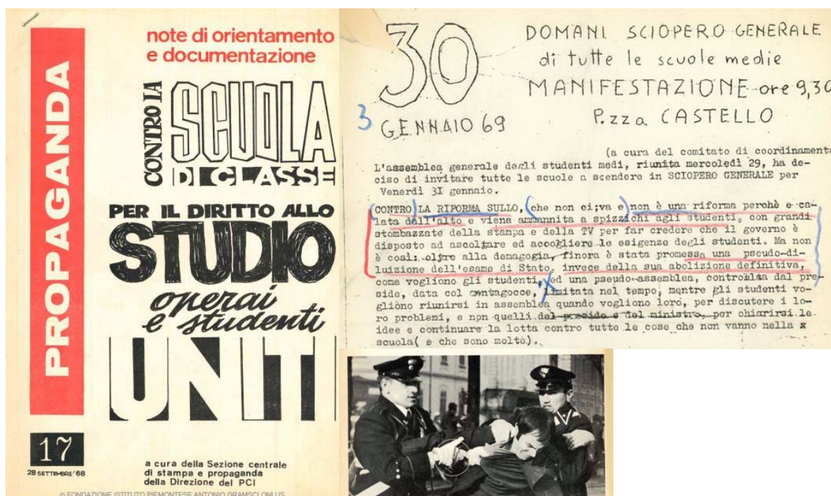
Figure 1: Examples of documents concerning the students and workers protest during the years 1968-1969.

We identified the students and workers protest during the years 1968-1969 in Italy as the specific domain to focus on in developing our proof-of-concept. The available documents concerning this period are mainly non-digitized typewritten leaflet (often containing manual annotations or drawing), newspaper or magazine articles, and some pictures (see Figure 1).