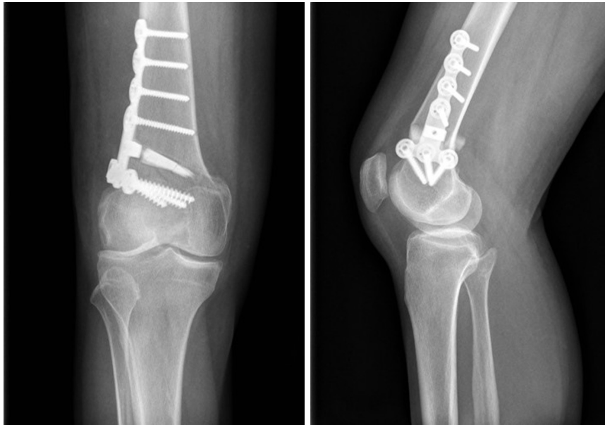
Figure 2 Post-operative X-rays (AP view on the left and lateral view on the right) of a lateral opening-wedge DFO stabilized using a Puddu Plate.

osteotomy healing (14). Figure 2 shows a post-operative x-ray of a lateral opening wedge osteotomy.