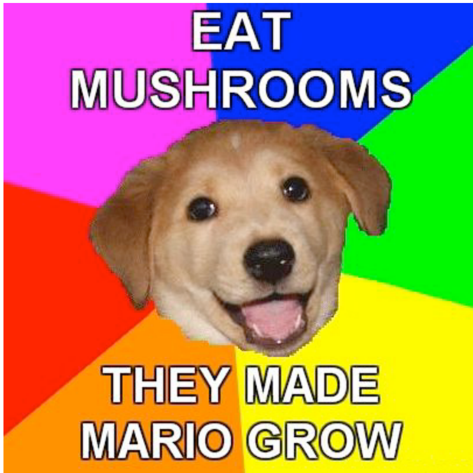
Figure 4. The Advice dog image macro meme (2006).

An important sub-type of sample-remix texts are the ‘symbiotic’ ones (cf. Constine 2009). The source text features an explicit ‘formula’ (cf. Constine 2013) or ‘template’ (cf. Rintel 2013), made up by fixed elements and variable elements that have to be filled or modified (according to a ‘guided remix’ practice; cf. Fig. 4). The model text is modified (the variable elements of the template are modified) from time to time, in order to make the result suitable to a given context or purpose. A new symbiotic text is the modification of a pre-existing model symbiotic text of the same ‘species’; both the hypo- and the hyper- texts are symbiotic (we may define such memes as ‘cannibalistic’). These texts present themselves as structuring units of meaning, rather than autonomous semantic units. The presence of a more or less explicit formula or template is what makes it possible not only to transform pre-existing texts that display such structure, but to re-create/imitate pre-existing texts (cf. infra ).