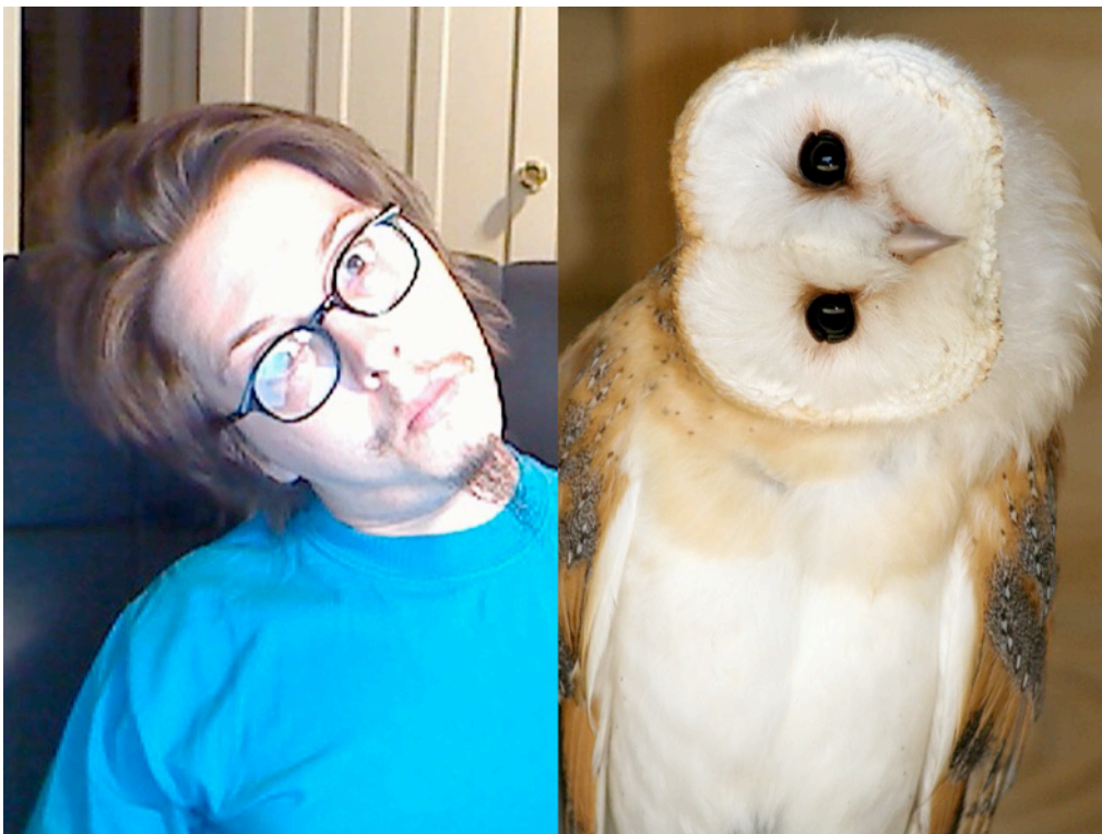
Figure 6. An ‘attempt at “stocking” using a photo of an owl’ (from Banks 2011).

Prototypical examples: Photo fads such as photobombing , planking , fingerstache , face masking ; thematic photo series such as the LOLcats ; thematic selfies such as the Pretty girls/ugly faces and the sellotapes ; reaction videos such as the ones to the infamous 2 girls 1 cup ; flash mob videos such as the ones derived from Gangnam Style and Harlem Shake ; 20 response/parody videos such as the ones derived from the Leave Britney alone video; campaign videos such as the Ice bucket challenge ; automatic generators of sentences mocking a given personality’s style.