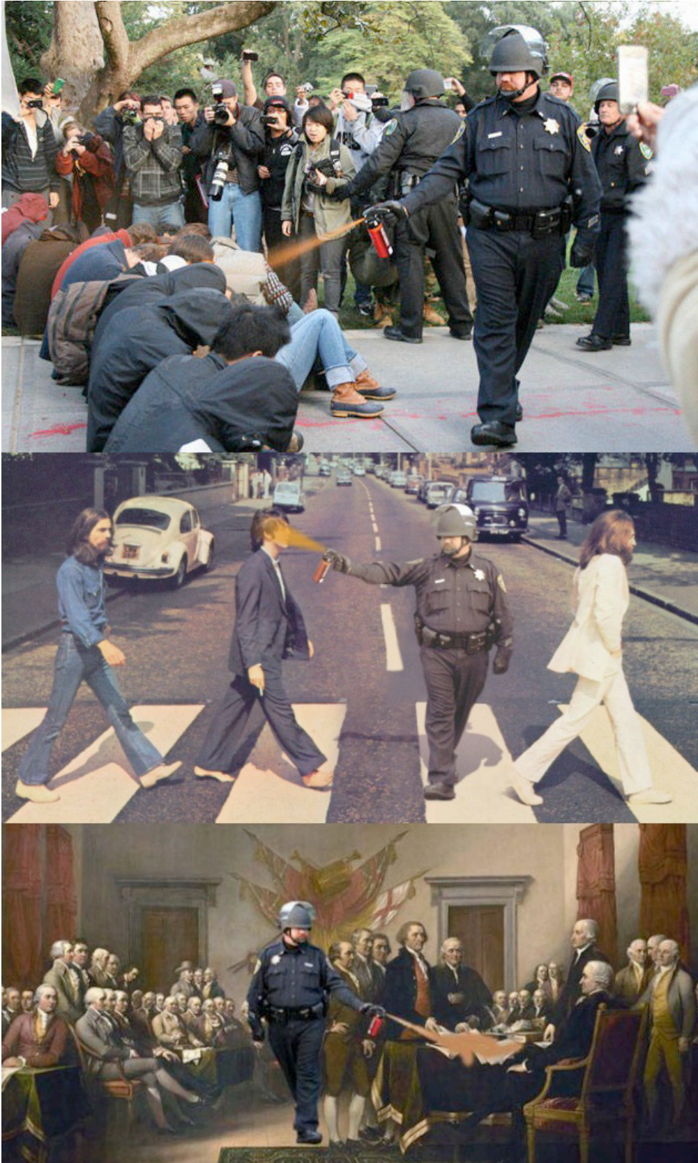
Figure 3. The Pepper spray cop meme icon (2011). At the top, the original photo.