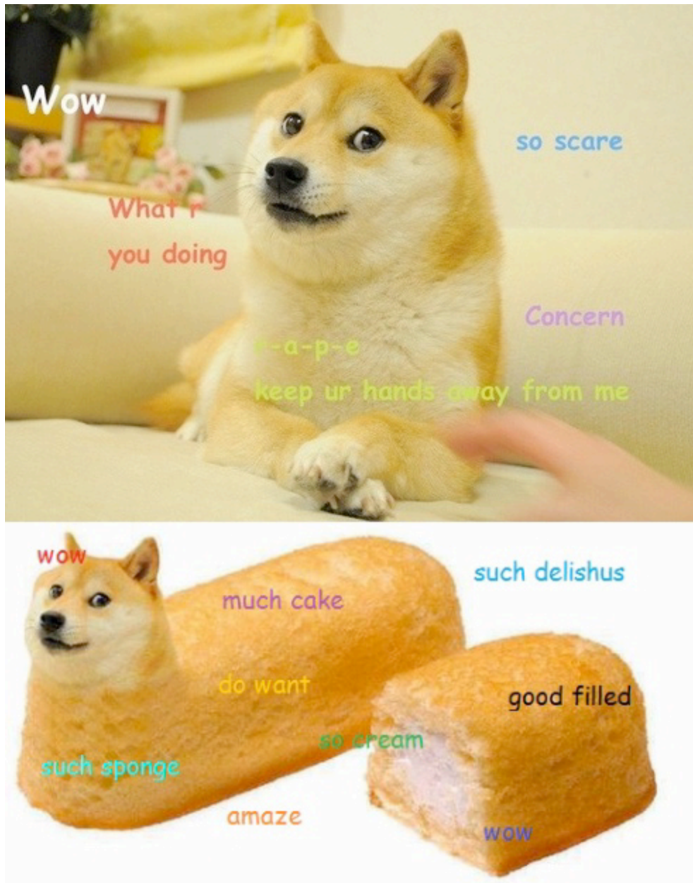
Figure 5. The Doge meme (2013). At the top, the original template meme, at the bottom, a sample-remix/ photoshopped picture.

Many Internet memes provide both icons and image macros. Figures such as Chuck Norris, Grumpy cat , Doge , and Ridiculously photogenic guy are both faces users stick onto pictures in order to resemantize and refunctionalize them, and proper template memes that users engage in customizing. In Doge , on the one hand, the dog's head is pasted onto pre-existing pictures and, on the other, the original colored Comic Sans captions are substituted with new keywords (cf. Fig. 5).