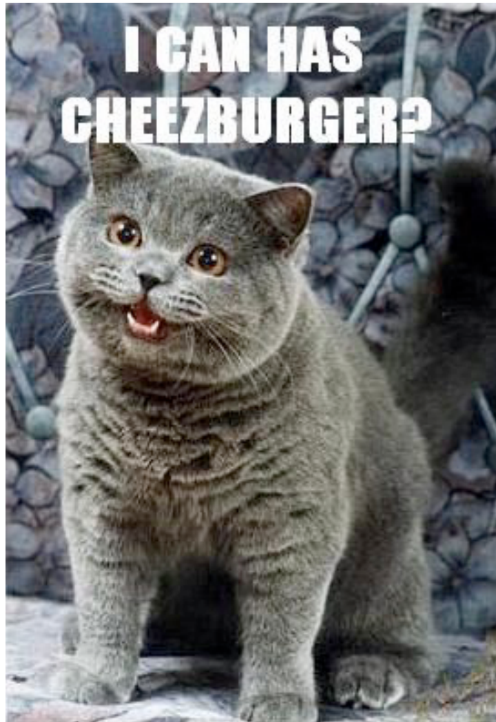
Figure 1. The Happy cat (2007). The original picture, uncaptioned, dates back to 2003.