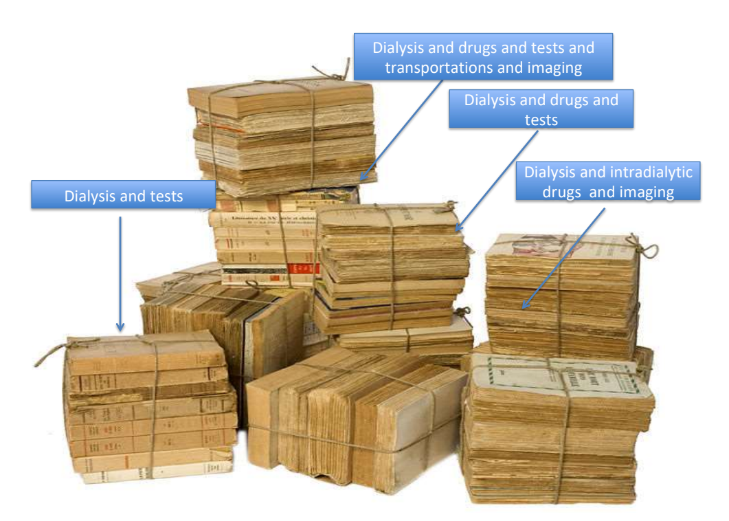
Figure 3. A bundle is not "just a bundle"; its meaning changes according to what is tied together.