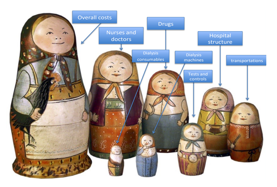
Figure 1. Dialysis costs as a matryoshka.

The first advantage of dealing with each item separately is that this allows us to better understand the cost of each one, targeting actions needed to control costs to specific issues, such as transportation or blood tests (Figure 1).