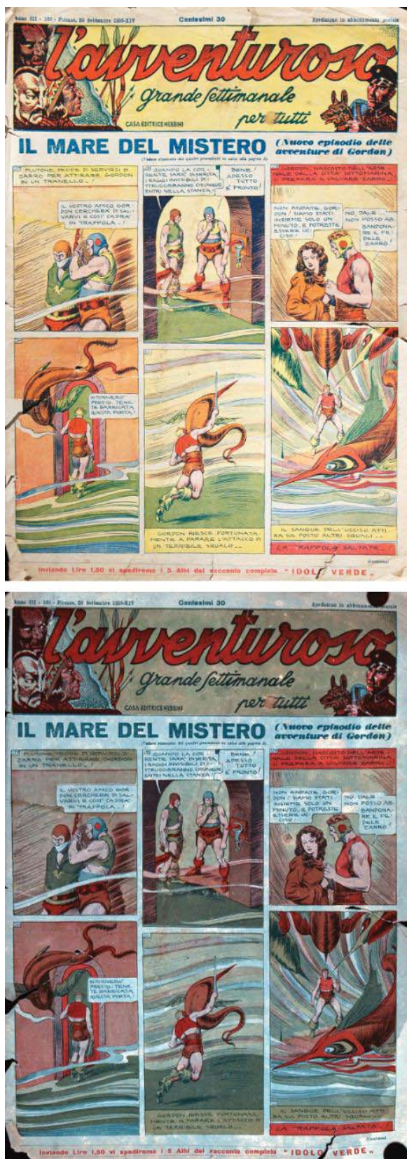
Fig 1. Visible (above) and UV (below) images of the issue 102 cover (1936)