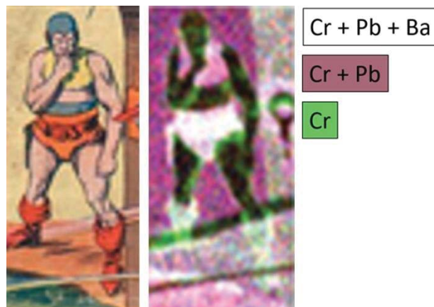
Fig. 4. Visible image (left) and XRF map (right). The black areas are related to the areas with no counts of Cr, Pb or Ba.

The main element identified in red print pigment is iron (Table 1), suggesting the use of iron-based pigments [8]; orange colour is characterized by chrome yellow mixed with lead oxide and lithopone ( \text{BaSO}_4 + \text{ZnS} ) (Fig. 4). In addition, FTIR- \mu ATR analysis performed on the red areas (Figure 3, red line) highlight the bands of magnesium carbonate at 1480 \text{ cm}^{-1} , 1420 \text{ cm}^{-1} and 795 \text{ cm}^{-1} [12] and barium sulphate at 1160 \text{ cm}^{-1} , 1110 \text{ cm}^{-1} and 1060 \text{ cm}^{-1} [13].