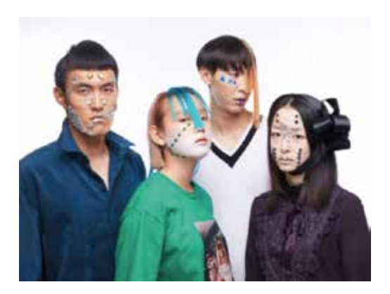
Figure 2. A. Harvey (2010) CV Dazzle.

A similar case is given by the London-based artists CV Dazzle<sup>11</sup> (Fig. 2), a facial make-up technique firstly pioneered by Adam Harvey, involving the design of irregular geometric shapes and of strong aesthetic impact, able to blind the facial recognition software but leaving the face visible to the human eyes. The combination of hair extensions, accessories and gems, disrupts people's faces, creating fake contours and obscuring its features. The artist and activist's motivation is not to make the process of recognition difficult for another individual, but rather to sabotage the biometric analysis carried out by facial recognition software.