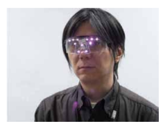
Figure 3. I. Echizen (2013) Privacy Visor.

Similar functions can be found in the Reflectacles Privacy Eyewear. This device blinds CCTV security cameras that rely on infrared for the night vision. The glasses block the biometrical software by reflecting a full-light and unrecognizable shape, which is not even a face, whereas a human wouldn't have any problem in recognizing the wearer.