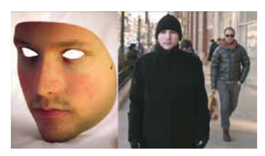
Figure 5. L. Selvaggio (2014) URME mask.

With facial recognition technology being widely used nowadays, rather than try to hide or obscure one's face from the camera, these devices allow you to present a different, alternative identity to the camera, my own. When you wear these devices the cameras will track me instead of you and your actions in public space will be attributed as mine because it will be me the cameras see. (Selvaggio, 2014)15