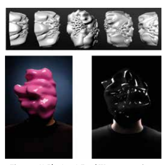
Figure 7. Z. Blas (2012) Facial Weaponization Suite.

They also put into evidence the inequalities and cultural bias these technologies contain. For example, the pink one, called the Fag Face Mask, is generated from the biometric facial data of many queer men's faces. As well, the black mask manifests the inability of biometric technologies to detect dark skin.