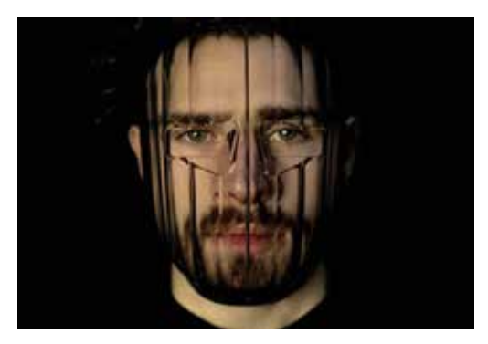
Figure 1. J. van Leeuwenstein (2016) The Surveillance Exclusion Mask.