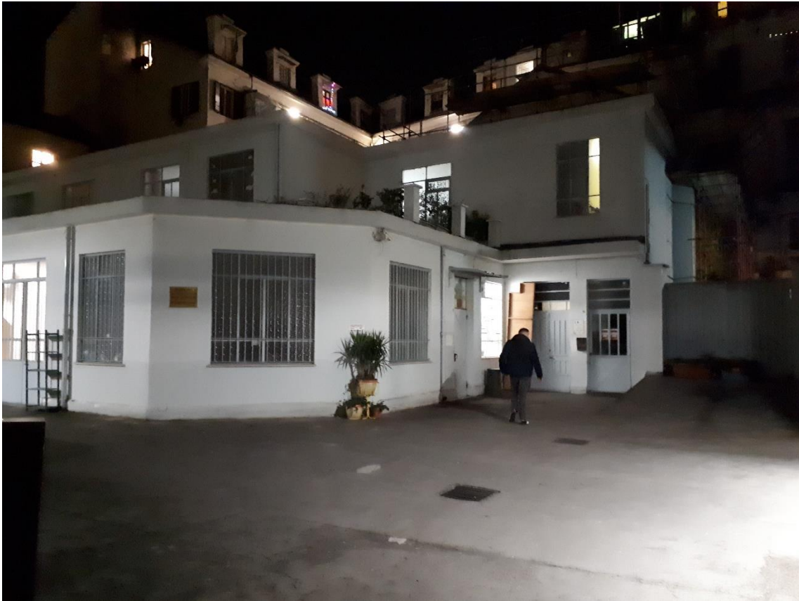
Figure 3 – Main entrance of an informal mosque in Turin, Italy

Note: Nothing suggests the presence of a place of worship inside the building