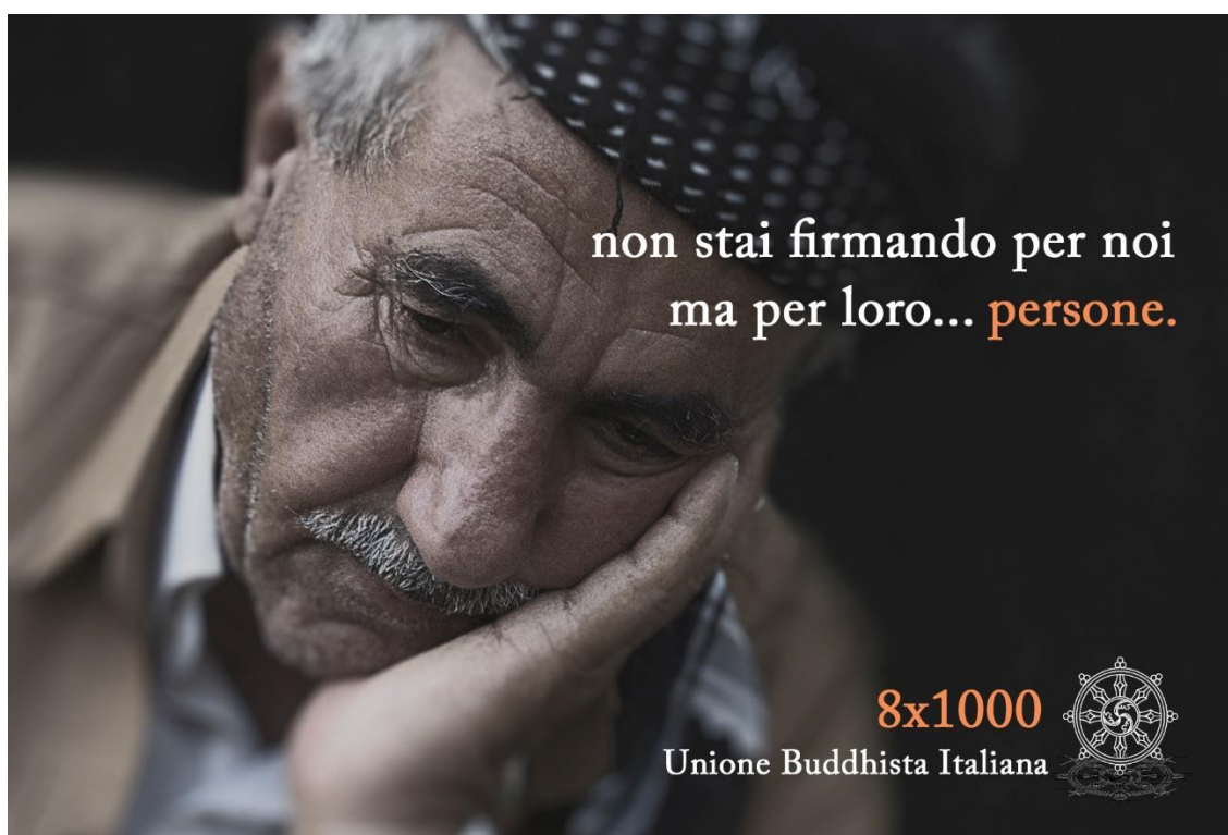
Figure 1 – An 8x1000 promotional ad by the Italian Buddhist Union

Note: The sentence reads '[Y]ou are not signing for us, but for them ... people'