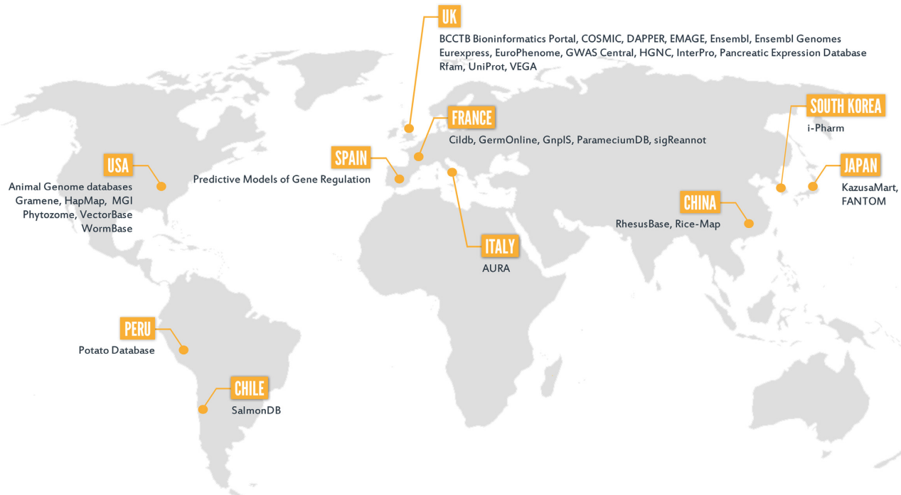
Figure 1. BioMart community databases and their host countries.

ing results from a few existing resources is challenging due to the lack of a complete, up to date catalogue of already existing resources and the necessity of constantly learning how to navigate new query interfaces. A different challenge is faced by collaborating groups of scientists who independently generate or maintain their own data. Such collaborations are seriously hampered by the lack of a simple data management solution that would make it possible to connect their disparate, geographically distributed data sources and present them in a uniform way to other scientists. The BioMart project has been set up to address these challenges.