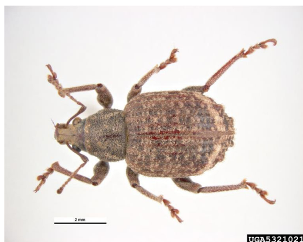
Figure 1: Phlyctinus callosus adult

Following detailed morphological studies and using molecular diagnostic tools, Haran et al. (2020) described P. callosus as a species complex of six species ( Phlyctinus callosus (Schoenherr), P. grootbosensis Haran sp. nov., P. xerophilus Haran sp. nov., P. planithorax Haran sp. nov., P. littoralis Haran sp. nov. and P. aloevorus Haran sp. nov.). Each of the five new species described by Haran et al. (2020) is reported from limited areas within South Africa with four found only in natural or semi-natural habitats, i.e. not regarded as pests of commercial crops. The species described by Haran et al. (2020) as P. callosus sensu stricto is recognised as having spread from South Africa hence literature published from studies in Australia and New Zealand, before the species complex was recognised and elaborated, remains valid for the purposes of this pest categorisation. However, Haran et al. (2020) note that it is difficult to morphologically distinguish between female specimens of P. callosus and the newly described species P. xerophilus and that more taxonomic research is needed.