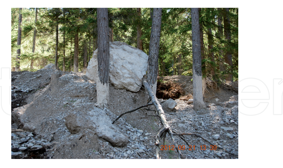
Figure 7. Detrainment of coarse debris from a debris flow by forest at the alluvial fan.

Trees and coarse woody debris can retain mobilized sediments and therefore reduce hillslope and torrential debris flows [75–79]. Large-scale datasets indicate lower frequencies [80] and runout lengths [81] of debris flows and debris avalanches in mature forests in relation to other land uses or clear-cuts and young forest. However, the reduction of runout lengths may be an effect of smaller landslide densities and erosion volumes in mature forests rather than a barrier effect [76]. Results of [78] indicate a higher potential of trees and logs to retain debris at loworder section of rivers than on alluvial fans. Detrainment of debris on alluvial fans by forest depends on sediment concentration and tree density [82]. Trees increase the flow resistance and favor the deposition of materials due to detrainment of (coarse) debris, but the protective effect is difficult to assess ( Figure 7 ).