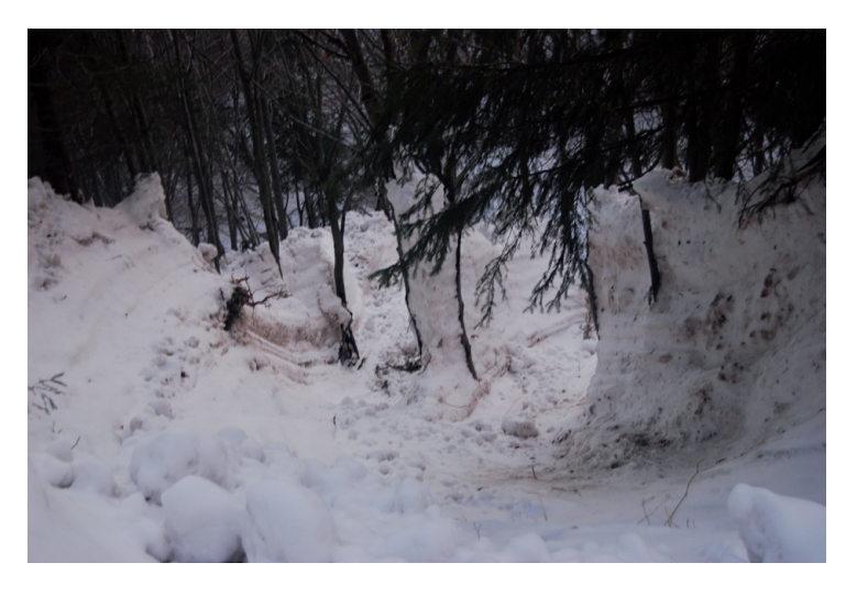
Figure 5. Detrainment of avalanche snow by trees.

surface roughness on short-slopes and to promoting stand stability by species selection, formation of resistant individuals and acceptance of shrub-dominated growth.