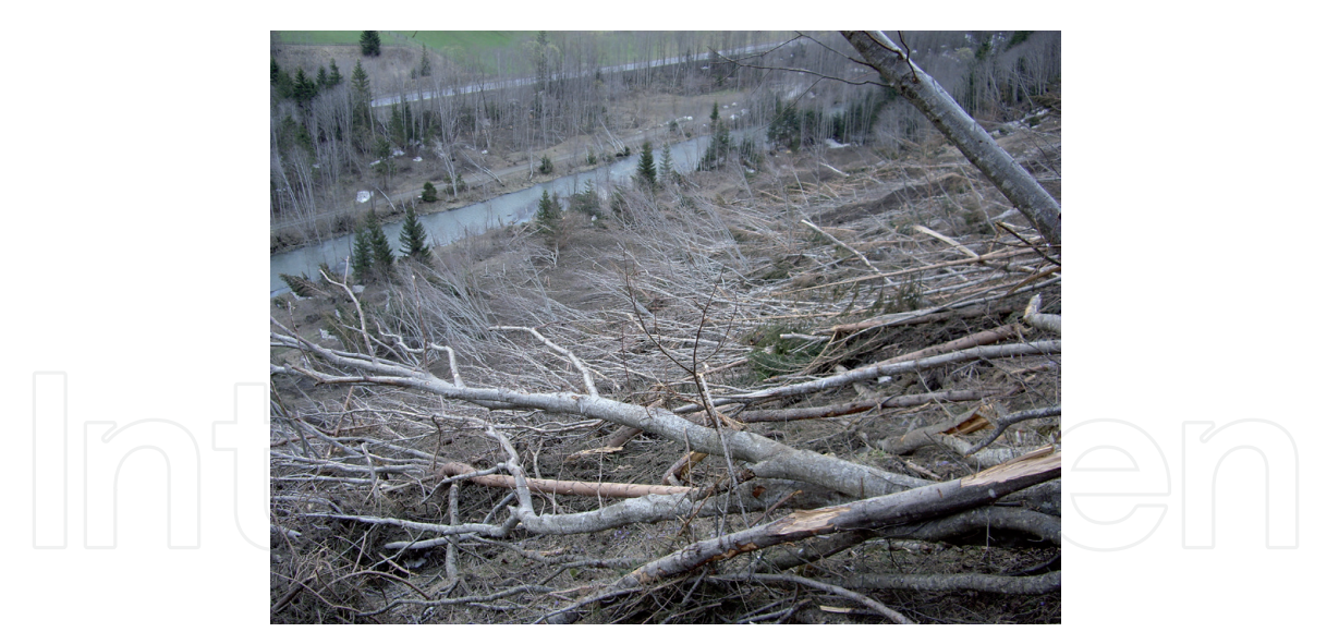
Figure 4. Destruction of a young deciduous forest by an avalanche.