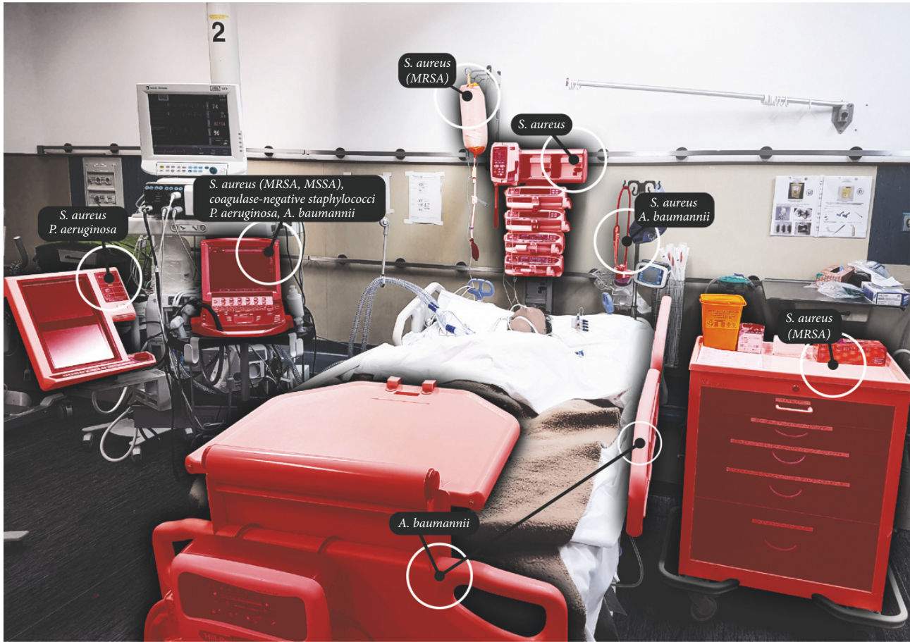
FIGURE 1: Patient zone with more frequently isolated bacteria contaminating inanimate surfaces and equipment.

(20–25%), and other sources (including environmental contamination, 20%). Understanding the mechanisms underlying cross-transmission of pathogens from inanimate surfaces and equipment may contribute to lay the foundation of effective infection control measures aiming to halt the spread of healthcare-associated infections. The aim of this review is to provide updated evidence on environmental contamination in the ICU, focusing on mechanisms by which bacteria are able to survive on inanimate surfaces, describing the concept of patient zone and healthcare area and the role of contamination for ICU-acquired colonization and infection.