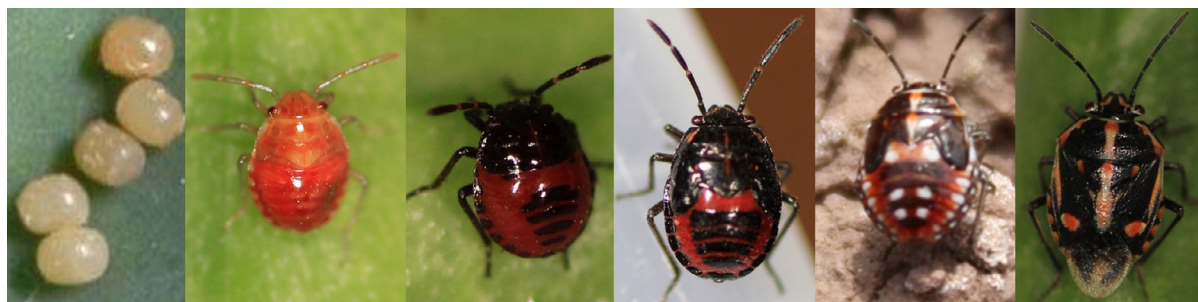
Figure 1: Life stages of the Bagrada bug.