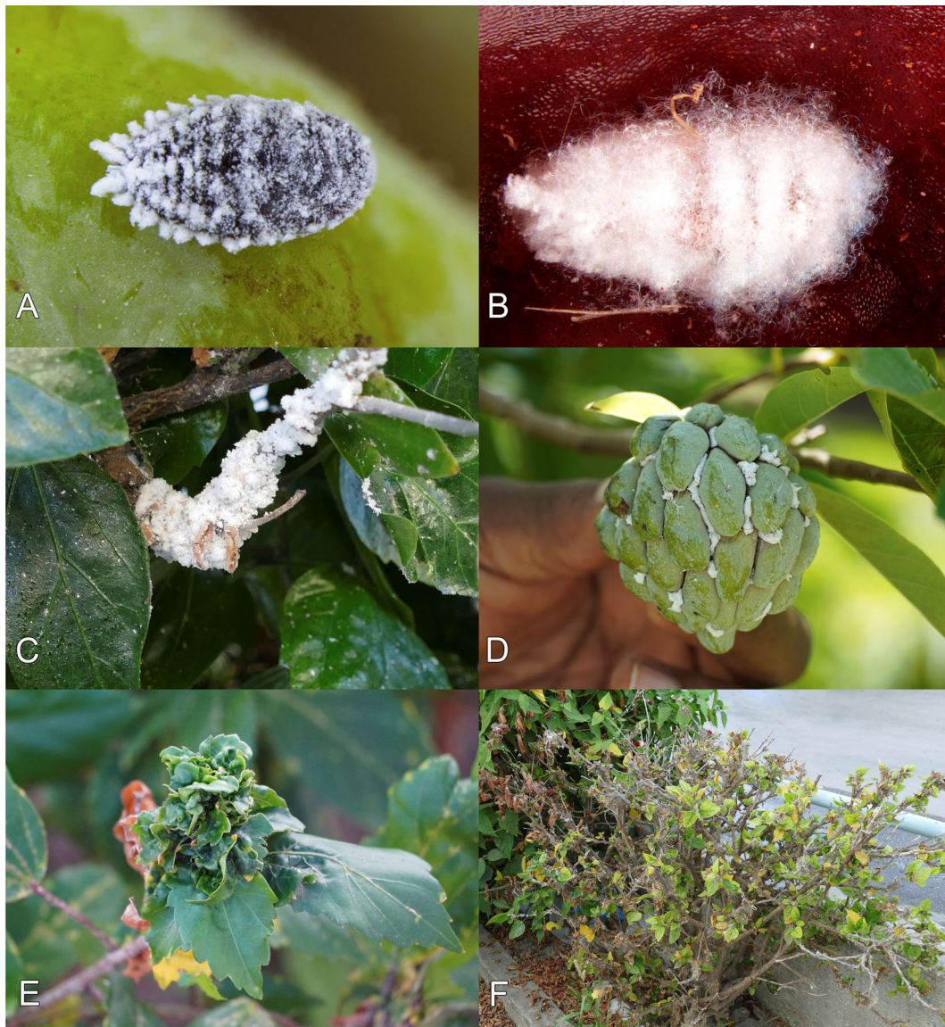
Figure 1: Maconellicoccus hirsutus : (A) adult female; (B) adult female covered in waxy filaments; (C) large infestation on hibiscus; (D) ovisacs in the crevices of Annona fruit; (E) distorted growth characteristic of plants infested by M. hirsutus ; (F) hibiscus plant in Rhodes, severely damaged by M. hirsutus