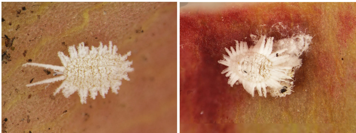
Figure 1: Pseudococcus cryptus , nymph (left) and adult female with ovisac (right)

Important features of the life-history strategy of P. cryptus are summarised in Table 2.