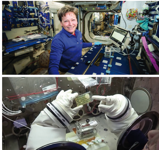
423 424 Figure 2. The NASA astronaut Peggy Whitson performing the Genes in Space investigation 425 on the ISS using the miniPCR and MinION. 426

418 the possibility to obtain up to a few thousands of base pairs for each read improved the 419 microbial identification specificity, non-trivial disadvantages include the initial skimming of 420 the huge number of produced reads, their quality check and assemblage in contigs useful for 421 classification, which require high computational effort and time (Tan et al., 2015). 422