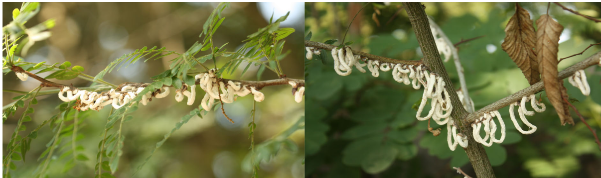
Figure 1: Takahashia japonica : mature adult females with their characteristic long, string-like, looped ovisacs, hanging from the bark

T. japonica is a parthenogenetic species. In Italy it has one generation per year (Limonta et al., 2022; Malumphy et al., 2019; Tuffen et al., 2019). Oviposition starts in late April and continues until early May (Limonta et al., 2022). Fecundity is high and the females can lay up to 5,000 eggs. The eggs are laid in a long string-like white waxy ovisac about 6–7 cm in length, hanging from tree branches and twigs in a characteristic loop (Figure 1) (Limonta et al., 2022). First instars crawl over the host plant or are locally dispersed by wind (Limonta et al., 2022). Nymphs feed on the lower leaf surface during the summer before moving to the branches in autumn, where they overwinter (Malumphy et al., 2019; Tuffen et al., 2019). The moult to the adult female occurs at the same overwintering site (Limonta et al., 2022). Important features of the life history strategy are presented in Table 2.