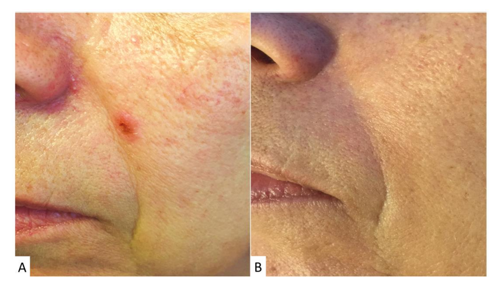
Figure 4. A 67-year-old female patient with basal cell carcinoma in the left nasogenian groove ( A ). Following treatment with 5% Imiquimod cream, applied once daily for 6 weeks, and subsequent photodynamic therapy with methyl aminolevulinic acid (single session), complete resolution of the lesion was observed with no recurrence at 24 months ( B ). A favorable cosmetic effect was also noted, with the underlying wrinkle appearing less pronounced following the therapeutic intervention.

keratosis, along with noticeable skin rejuvenation. The success of this treatment approach prompted a follow-up MAL-PDT session. In the fourth case, a 67-year-old woman with basal cell carcinoma in a cosmetically sensitive area was managed with a combination of Imiquimod 5% cream and MAL-PDT. The treatment resulted in complete clinical remission of the carcinoma, with the treated skin displaying fewer telangiectasias and improved plumpness compared to the surrounding areas, indicative of mild skin rejuvenation. These cases collectively emphasize the efficacy of personalized treatments for addressing both precancerous skin lesions and the enhancement of skin aesthetics. Patients experienced not only the resolution of their primary concerns but also improvements in skin texture, contributing to overall satisfaction and well-being (Figure 4).