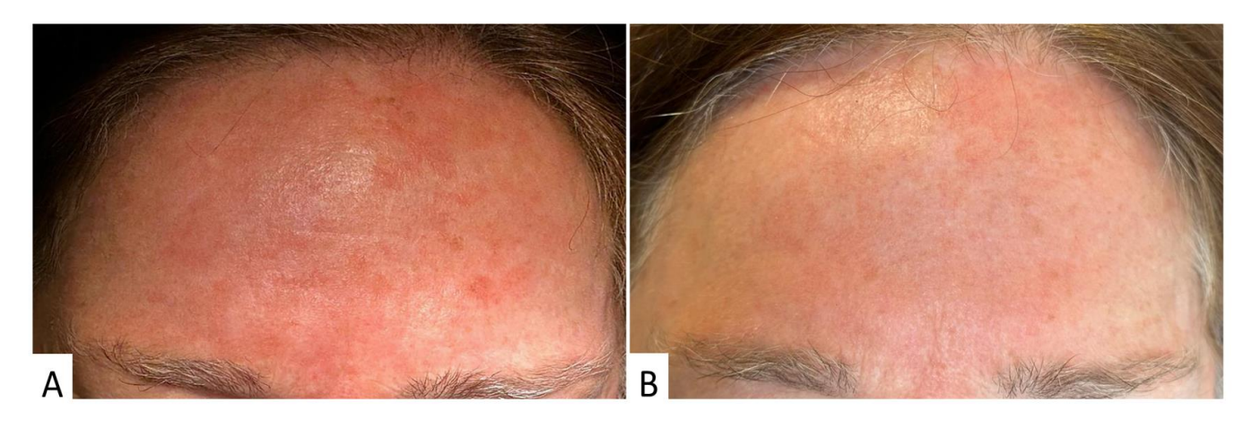
Figure 3. A 58-year-old female patient with a field of cancerization and numerous superficial actinic keratoses on the forehead ( A ). After photodynamic therapy with methyl aminolevulinic acid (single session), resolution of superficial lesions and a reduction in cutaneous imperfections (including hyperpigmented macules) were observed. This result was durable even at 5 months post-photodynamic therapy ( B ).