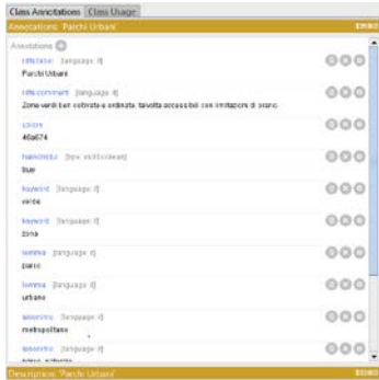
Figure 2: Linguistic information associated to concept “Parchi Urbani” in the OnToMap ontology (visualized using Protégé editor). Each linguistic item is annotated with the reference language (here, Italian – it) and the ontology supports the specification of information in multiple languages.