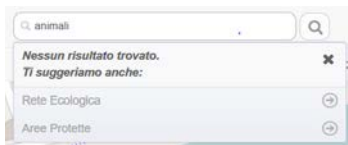
Figure 3: Sample suggestions for query expansion in a case in which OnToMap does not find any solutions to the search query. Here, the user asked for “animali” (animals) and the only possibly related concepts found by the system are “Rete Ecologica” (Ecological Network) and “Aree Protette” (Protected Areas), which are loosely related to animals through linguistic knowledge.

2) Then it attempts to match the words of the normalized query on the ontology concepts. There are different degrees of matching: