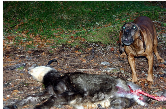
Figure 2 Photo of laboratory-like conditions, showing the trained dogs with the carcasses of mangy Alpine chamois.

The same training scheme, with the only deviation that mangy carcasses were used for "true" trails and mange-free carcasses for "false" trails, was used to accustom Ingo to the exclusive search of infected animals. At first, Ingo barked whenever he found a carcass (mangy or mangy-free), but he was only rewarded when successful in localizing a mangy carcass. Additional training was carried out with mangy carcasses only. A mange-infected carcass was located in a known place, ~300 m far from the dog (in some cases under snow or in the dense forest). The dog was trained to search and locate the mangy carcass, and he was taught to approach to mangy carcass's pulling away point (the nearest point to pull away the carcass from the snow). By the end of the specific training phase, Ingo had learned to seek out only the mangy carcasses, even under the snow cover. His ability to track and stop the living mangy chamois was similar to his original work to recover wounded animals in a hunt context, but in this case mangy animals were the "targets" and healthy ones the "false" (Figure 2). Ingo had 3–4 training sessions each week for approximately 6 months. The training session took between 5 minutes, when carcasses were near to the street or they were approximately localized by forest