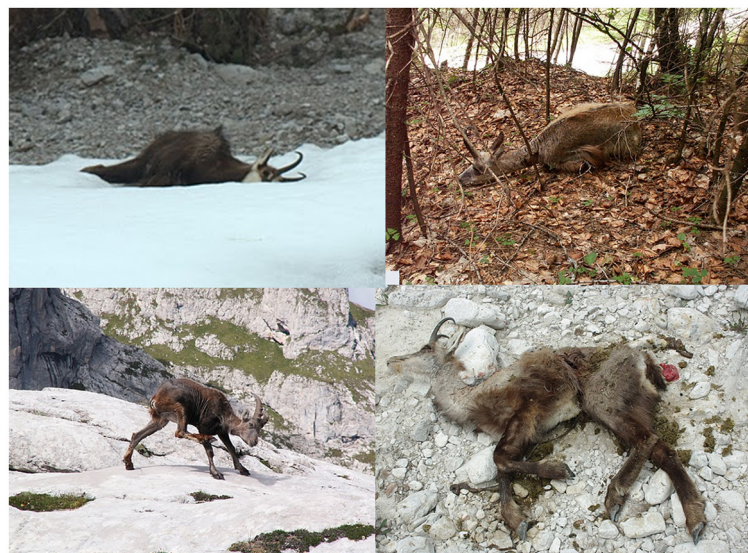
Figure 1 Photos of decomposed carcasses, and sick Alpine chamois and Alpine ibex showing mangy lesions.

At that time of the index case, conservative census data by direct observation indicated that the local chamois population, for which yearly census data by direct observation were available, was numbering 810 heads (6.0 chamois/100 ha). In the following years, a significant demographic decline (with peak mortality in years in 1997, 1998 and 2001) was observed, leading to a low post-epidemic density of 1.4 heads/100 ha and a conservative decline estimate of 77% (Figure 1). The first epidemic wave of scabies waned during years 2003 to 2007,