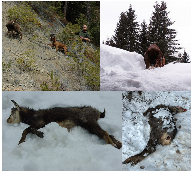
Figure 3 Photos showing the handler and the trained disease-detector dogs in the field, and a number of Alpine chamois carcasses collected from under the snow cover. The handler, Roberto Permunian, is consented to the use of his image for publication purposes.

spring compared with the other seasons [25]. Interestingly, the regular use of dogs showed that occurrence of mange is not as concentrated in winter and early spring as observations from distance to detect scabietic chamois would suggest [25].