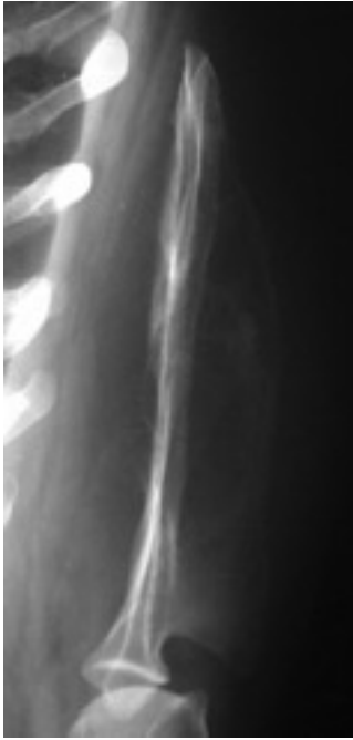
Figure 1 Caudocranial projection of the left scapula from case 41 ; note an osteolytic expansile lesion with amorphous periosteal reaction involving the medial surface and the scapular spine with soft tissue swelling around. A subtotal scapulectomy was performed.