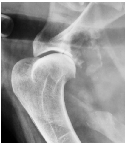
Figure 2 Lateral radiographic projection of the scapulohumeral joint from dog 28 with scapular fibrosarcoma. Note lytic changes extending from the distal caudal aspect of the scapula to the glenoid cavity. Total scapulectomy with partial humeral head resection performed.