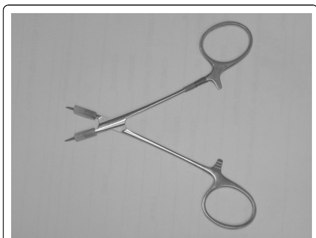
Figure 2 Two pieces of 5 mm latex tubing were placed around the jaws of a mosquito forceps.

an analog pressure gauge and a 50 ml syringe using a technique similar to a previously published study [15]. Briefly two pieces of 5 mm latex tubing were placed around the jaws of a mosquito forceps (Fig. 2). The intravenous catheter was partially fed along the internal trocar, so to protect tissue from its sharp tip (Fig. 3A). The catheter was then introduced into the artery that was then clamped with the modified mosquito forceps (Fig. 3B). A solution of methylene blue dye and water was injected through the catheter until ligature failure, as identified by loss in pressure or dye leakage [2,7,15]; maximal luminal pressure was recorded and compared between groups. When pressures reached 1050 mmHg, injection was stopped. The leaking pressure test was performed by two operators blinded to the specimens' group.