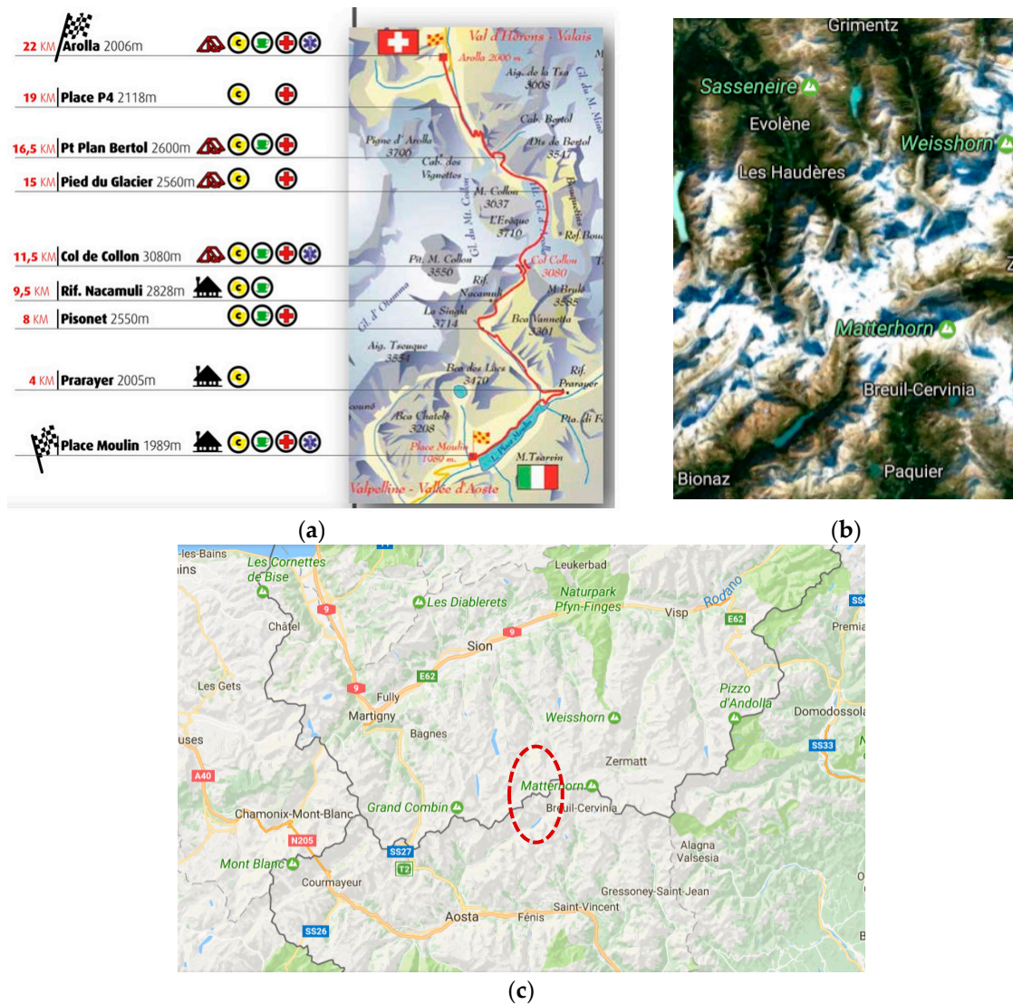
Figure 2. (a) The Collon Trek Trail. Source: Collon Trek official internet site ( http://www.collontrek.com ); (b) Collon Trek area of interest. Source: Google map; (c) The area. Source: Google map.

Figure 2a contains the official map of the trail, Figure 2b shows the territory, whereas Figure 2c represents the location of this alpine transnational area.