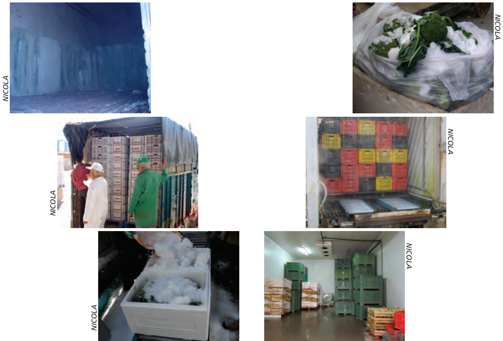
Plate 7 (From left to right and top to bottom) Truck with ice for transport from field to storage Body icing in closed box storage for rapid raw material cooling Closed and shaded truck for transport from harvesting area to storage Hydrocooling system in transport truck on arrival at packing house Top icing in closed insulated box storage for cold preservation of raw material before dispatching Storage room at cold temperature on a small farm in Croatia

of each vegetable in order to properly schedule and manage the raw material. It is important to avoid mixtures and promiscuity, which might accelerate inner degradative physiological pathways. Failure to maintain optimal conditions or to properly manage raw material can cancel the positive effects of the previous steps in the supply chain, thus reducing the shelf-life.