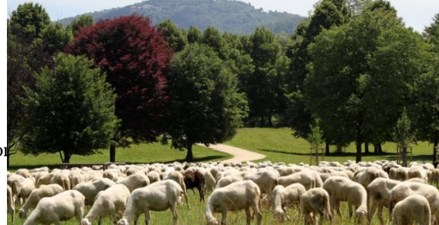
Figure 1. Biosphere Reserve CollinaPo with 14 core zon processing)