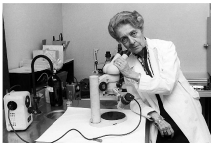
Figure 2. Rita Levi Montalcini (Nobel Prize in 1986 for Nerve Growth Factor discovery).

OXERVATE® case study. Oxervate (brand name of cenergermin eye drops solution) has been recently approved in Europe and US with indication in moderate and severe neurotrophic keratitis (NK). Cenergermin is the INN name of rh-Nerve Growth Factor (rhNGF), a protein (neurotrophin) discovered by Rita Levi Montalcini (Figure 2). NGF is a naturally occurring protein in humans involved in differentiation, growth, maintenance and survival of neurons.