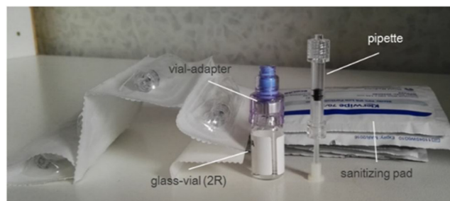
Figure 3. Oxervate® administration kit.

contains 1.0 mL of the product. The ocular administration of the drug product is achieved by means of a plastic vial adapter positioned on the stopper head to which a polycarbonate pipette (with a capacity of 120 µL) is connected in order to withdraw the solution and deliver a drop of liquid into the eye. Six administrations per day from a single vial and using 6 pipettes are carried out (daily multidose vial).