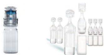
Figure 1. Preservative free multidose and BFS monodoses.

Topical eye drops are the most convenient and patient compliant route of drug administration, especially for the treatment of anterior segment diseases. More than 70% of ophthalmic drug products are simple solutions supplied in multi-dose plastic container closure systems (CCS), which generally contain a weekly or longer supply of the drug. These products may be intended for the treatment of acute or chronic conditions. In the 1950's, the introduction of the use of preservatives in ophthalmic products to prevent contamination after opening constituted a considerable advance, allowing the use of multidose containers. Thirty years later, numerous publications have shown the unfavorable effects of preservatives on the cornea, the conjunctiva and the tear film, causing irritation, inflammation and dry eye. In order to avoid this problem, single sterile dose units were put on the market (i.e., blow, fill seal (BFS) technology). From the 1990's, also multi-dose bottles (Figure 1) capable of dispensing preservative-free eye drops (PFMD) appeared on the market: the first was ABAK® system from Thea, followed by a series of preservative-free packaging forms such as OSD® Aptar and Novelia® Nemera technologies.