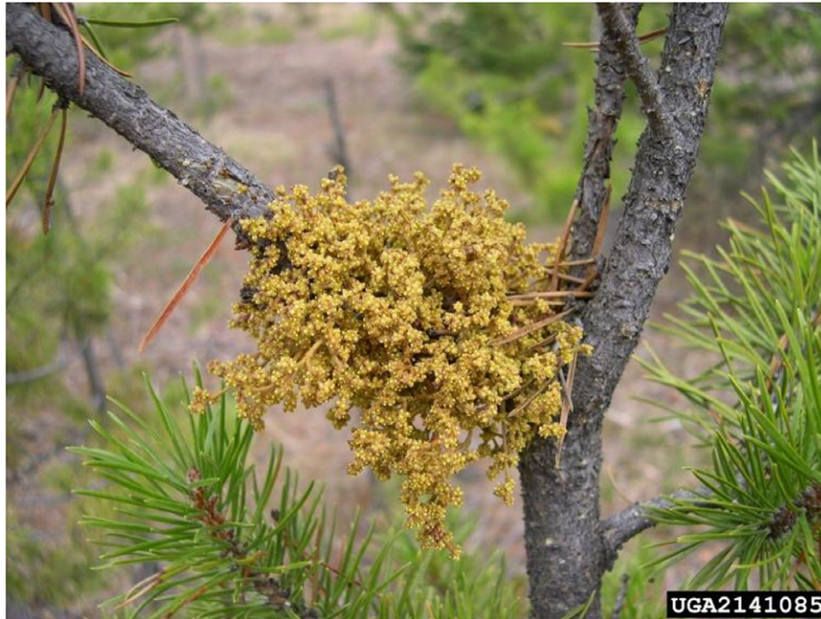
Figure 3: American dwarf mistletoe ( Arceuthobium americanum ) on lodgepole pine ( Pinus contorta ), Wyoming, USA. Photo by Brytten Steed, USDA Forest Service, Bugwood.org. Available online: https://www.forestryimages.org/browse/detail.cfm?imgnum=2141085

Should non-EU dwarf mistletoes be introduced into the EU, impacts can be expected to coniferous woodland, plantations, ornamental trees and nurseries.