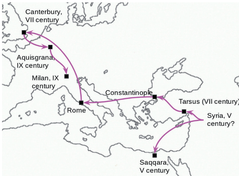
Figure 1. Litany of the Saints : Origins and diffusion.

After St. John (the Baptist), who can be considered an ur-martyr, the list contains fourteen martyrs, seven men and seven women. The list is hierarchically ranked: apostles, popes, and virgins; these groups will be inherited by litanies. At the end of the list, all the saints are invoked. Since the list contains only martyrs, the final closure basically identifies martyrs and saints.