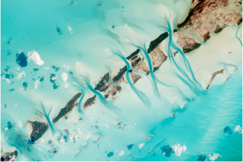
International Space Station, Great Exuma Island, Bahamas, emphasizing island cays and tidal channels, 2015. ( https://www.nasa.gov/image-feature/great-exuma-island-bahamas ).