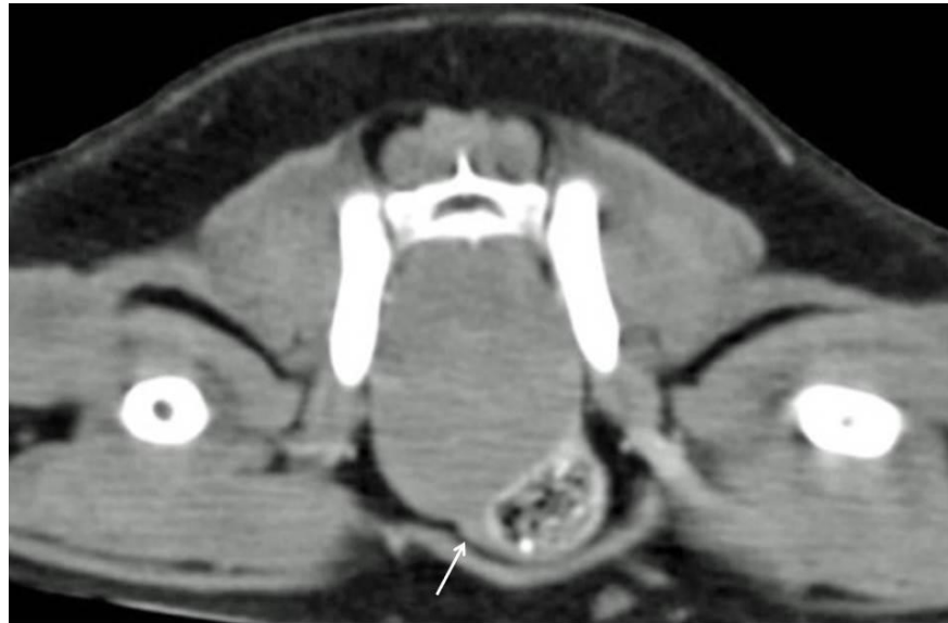
Figure 1. Tomographic appearance of an intra-pelvic mass. The colon is displaced ventrolaterally. The urethra is highlighted by the white arrow.

Computed tomography revealed the presence of a single and 2 adjacent masses in 6 out of 7 (86%) ( n 3–5, 9–11) and 1 out of 7 cases (14%) ( n 8), respectively. The masses appeared well defined and homogeneous, with mild contrast enhancement in all cases. Colonic and rectal displacement, and urethral compression were always present (Figure 1).