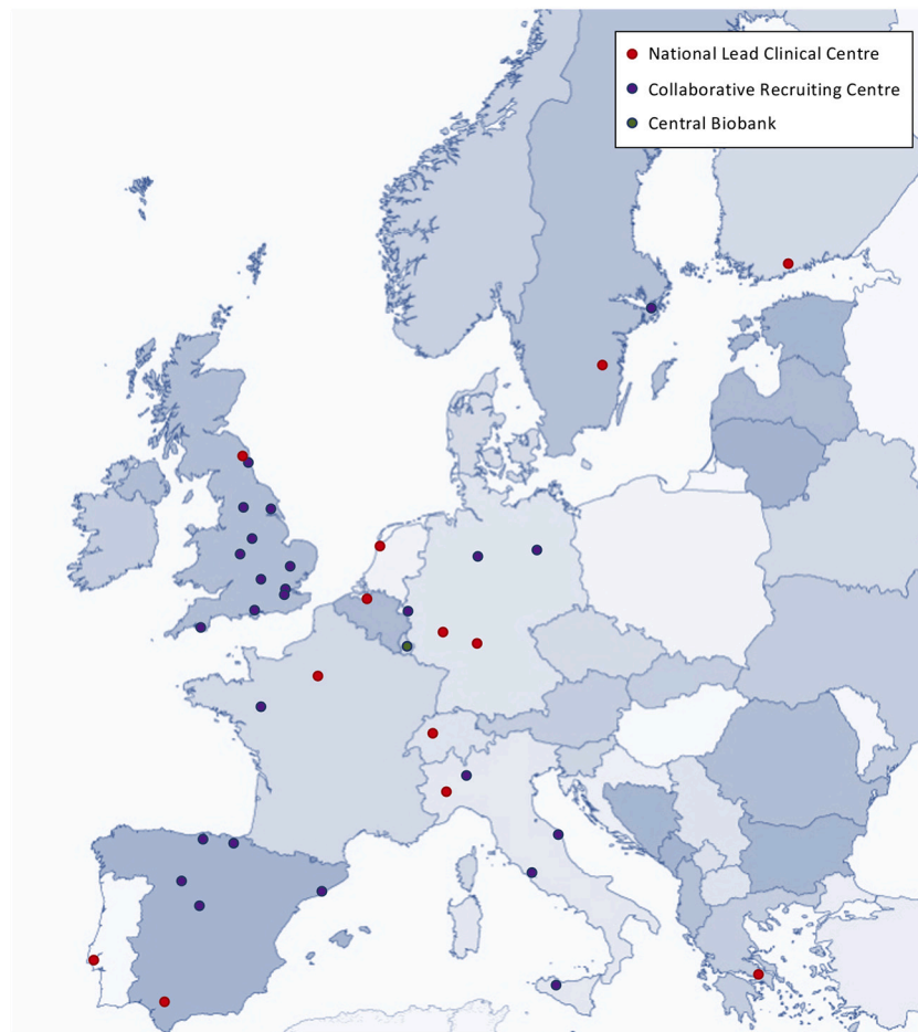
Fig. 1. Map of recruiting sites into the European NAFLD registry.

health challenge. It is characterised by the increased accumulation of hepatic fat (> 5%) and is closely linked with the presence of the metabolic syndrome and its components: obesity, type 2 diabetes mellitus, hypertension and dyslipidaemia. [1,2] The exclusion of other causes of