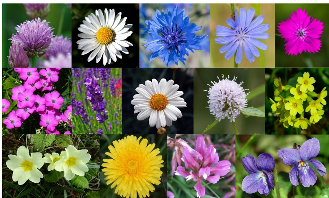
Figure 1. Detail of the flower of the fourteen native species selected for this study. From left to right, first line: Allium schoenoprasum L., Bellis perennis L., Centaurea cyanus L., Cichorium intybus L., Dianthus carthusianorum L.; second line: Dianthus pavonius Tauesch, Lavandula angustifolia Mill., Leucanthemum vulgare Lam., Mentha aquatica L., Primula veris L.; third line: Primula vulgaris Hudson, Taraxacum officinale Weber, Trifolium alpinum L., Viola odorata L.