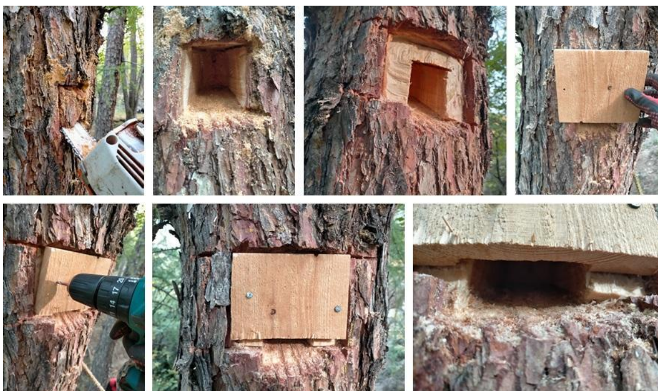
Figure 4. Successive phases of making artificial holes for bats in tree trunks. An experienced forest climber drills a large hole with the help of a chainsaw. The opening is then narrowed with a wooden rod to create a smaller entrance favorable to bats.