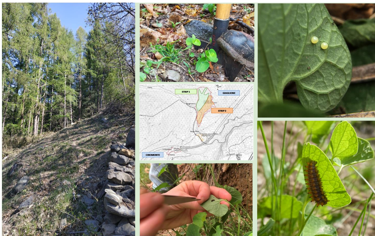
Figure 3. Images of the ecological corridor, and the translocation of host plants ( A. pallida ) and Z. polyxena larvae. The map shows the area where the ecological corridor was located (Strip 1; 10 ha), and an area with thinning and selective cutting (Strip 2; 40 ha).

In addition to creating the clearings, the plan included forest improvements, such as thinning and selective cutting in about 40 ha in the surrounding area of the corridor. In order to compensate for the loss of old trees, forest aging interventions and artificial bat roost installations were planned for at least 30 trees in forest and forest margins surrounding the expansion site. In particular, two artificial holes were produced in the trunk of broad-leaved trees—and also some conifers—with a diameter of greater than 40 cm (Figure 4). Bat boxes (a wooden Kent double-chambered box and a Schwegler 2F woodcrate box) were installed in the same trees to increase roosting sites—and to compare the usefulness of artificial holes in respect to bat boxes; and a black corrugated fiberglass panel was fixed around the trunk to produce artificial cavities similar to cracks in the cortex. While wooden bat boxes are known to be mostly used by Pipistrellus species [58,59], Schwegler bat boxes can also be occupied by Myotis , Nyctalus , and Plecotus species [60–63]. Artificial roost orientation was varied in order to ensure greater heterogeneity, also based on thermodynamic conditions [64]. By differentiating artificial roost type and orientation, we therefore aimed at improving suitability for different bat species. In 2020, 30 trees were provided with artificial cavities and nest-boxes.