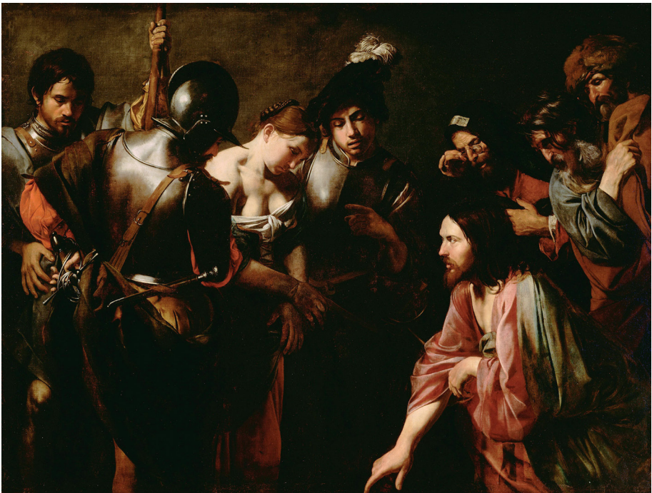
Fig. 2: Valentin de Boulogne, Jesus and the adulterous woman , 1620, oil on canvas, 167 × 221.3 cm, Los Angeles, Paul Getty Museum. Public Domain.

Massimo Leone has also developed this method in several publications. His approach in this kind of research is characterised by taking into consideration not only the exegetic literature and general cultural context, but also iconography. For instance, Leone (2021) proposes a new interpretation of the famous Pericope of the Adulteress ( John 8:6–8) in which Jesus traces mysterious signs on the ground. Leone compares similar customs found in several cultures, such as Greek and Arab ones, and analyses the iconography of this Pericope (for instance, Valentin de Boulogne’s Jesus and the adulterous woman , Fig. 12). He then concludes that Jesus’s gesture corresponds not to writing but to unwriting fundamentalist and intolerant law. Leone interprets Jesus’s action of doodling as a semi-symbolic system in which the traditional written Law is replaced by a form of non-verbal contract which grants a more immediate relationship with transcend-