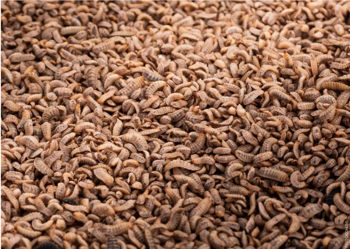
Figure 1. Black soldier fly ( Hermetia illucens ) larvae