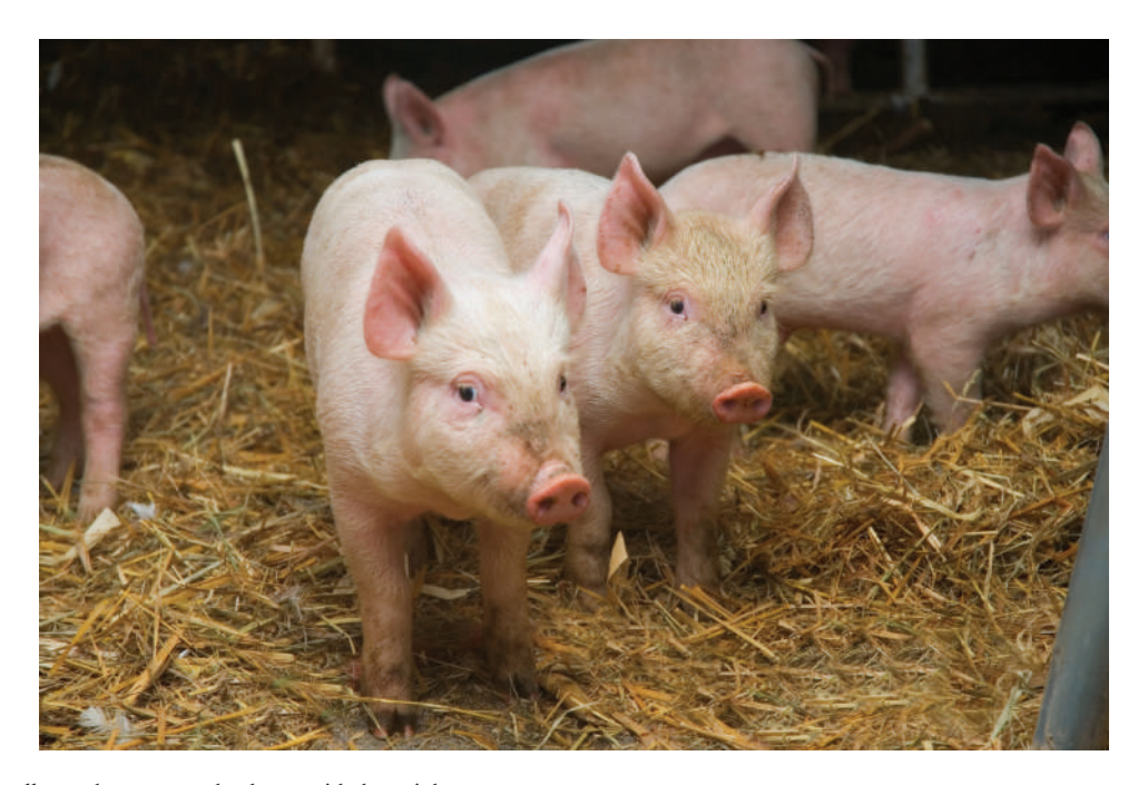
Figure 5. Live Hermetia illucens larvae can also be provided to piglets.