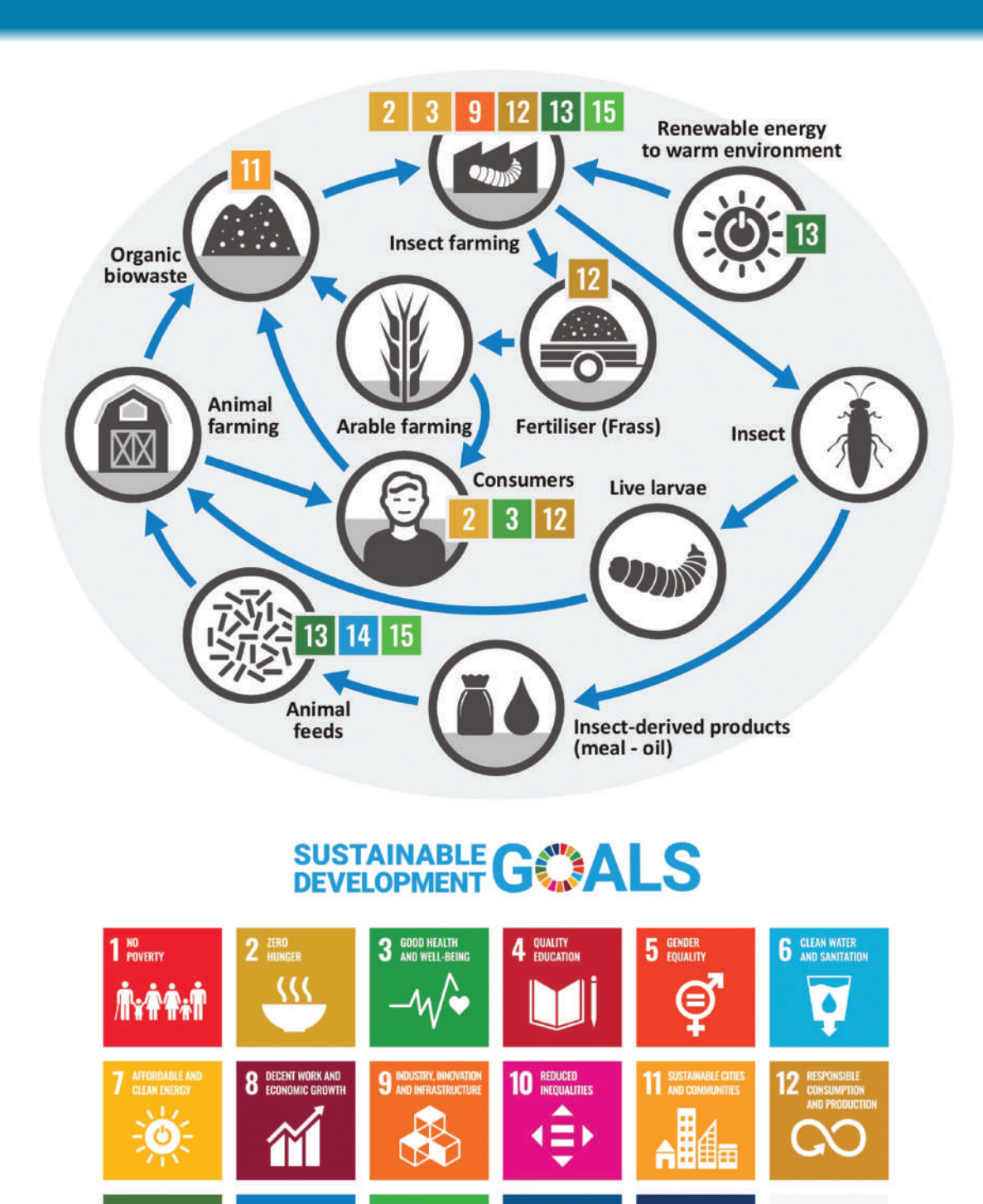
Figure 2. Circular Economy and Sustainable Development Goals related to insect farming.

Research performed using insects in shrimp nutrition is limited and recently reviewed by Sánchez-Muros et al. (2020). No differences in Litopenaeus vannamei performances are reported up to 30.5% of full-fat TM meal inclusion fully substituting FM as far as a correct balance of essential amino acids is ensured. In a non-balanced formula, a percentage including