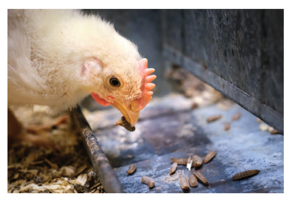
Figure 4. Poultry feeding live Hermetia illucens larvae.