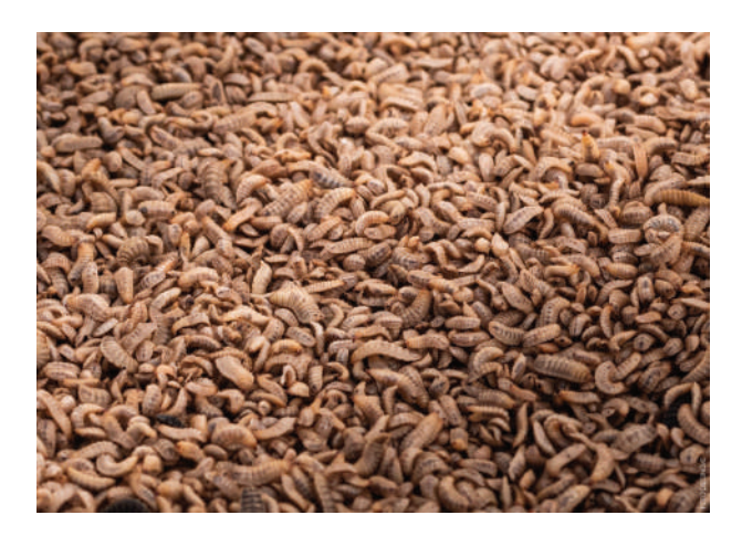
Figure 1. Black soldier fly ( Hermetia illucens ) larvae.

extent, the common housefly ( Musca domestica , MD) (van Huis, 2022).