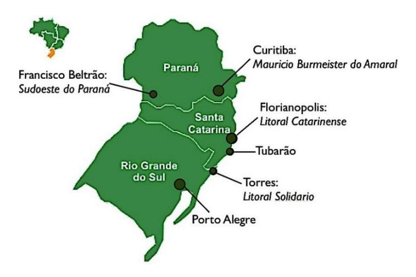
Figure 3. Cities and nuclei of the Rede Ecovida de Agrecologia considered in the survey.

The data used in this study are drawn from responses to a survey instrument administered between January and March 2011 in three nuclei of the Rede: Litoral Solidário, Litoral Catarinense, and Sudoeste do Paraná. Four nuclei of the Rede operate in the areas of analysis (see Figure 3).