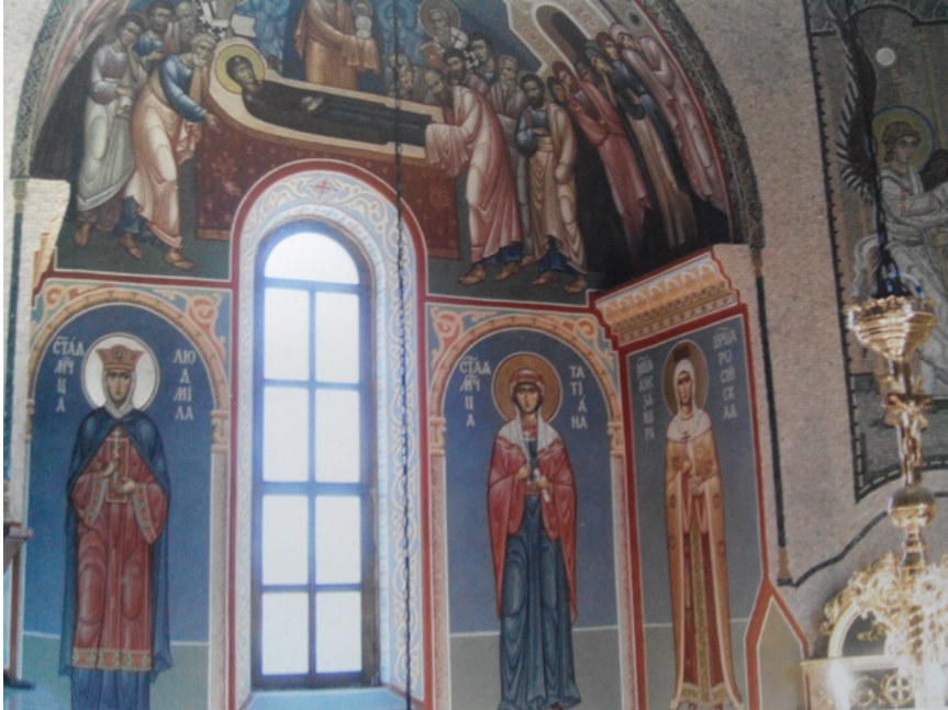
Fig. 3 A part of the painting of the northern wall of the temple: the Assumption of the Most Holy Theotokos, below are images of the holy martyrs: Lyudmila, Tatyana, Empress Alexandra (2006).

In the upper part of the southern wall, opposite the Assumption of the Blessed Virgin Mary – the Nativity of Christ, then – especially revered saints: Saint Blessed Prince Dimitri Prilutsky, Saint Martyr. Patr. Tikhon, Saint Rights. John of Kronstadt. In the medallions opposite the holy royal martyrs-children are images of Saint Martyr. Faith, Hope, Love and their mother Sophia.