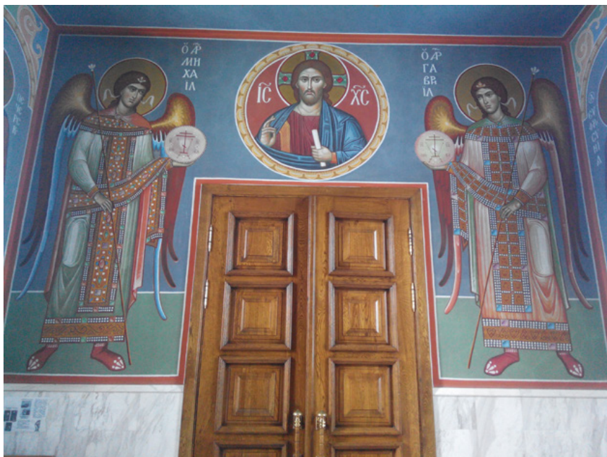
Fig. 4 The western wall of the church: the image of Jesus Christ in a medallion, on both sides of which the archangels Michael and Gabriel are depicted by Alexander Chashkin (2006).

Consequently, when compiling the program for painting this temple, the general canons of building iconographic plots, the dedication of the temple were taken into account (the images of the Most Holy Theotokos are found both in the conch of the apse, and in the under-dome skufya, and on the kliros; the main background of the painting is blue, which is considered the color of the Most Holy Theotokos and symbolizes Her ever-virginity 10 ); the purpose of the temple as the main temple of the Lavra skete was taken into account – the images of the saints make up a significant part of the paintings.