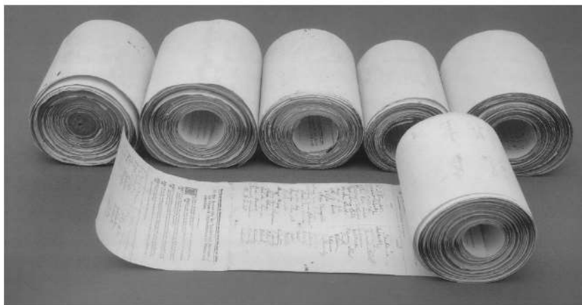
Archives New Zealand, The 1893 Women's Suffrage Petition; CC BY, https://flic.kr/p/ruLjQh (part.)