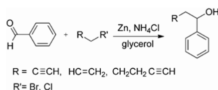
Scheme 3. Barbier reaction in Glycerol

Another striking example of a reaction in glycerol is the Barbier reaction, which was first studied by using benzaldehyde as a substrate (Scheme 3). We compared the classical solvent system THF/NH 4 Cl with glycerol/NH 4 Cl (Table 4). The effect of a US cleaning bath on the reaction rate was negligible, whereas using a US horn at room temperature yielded 80 % alcohol in only 15 min, and 100 % conversion after 1 hour without byproduct formation (entries 4–6).