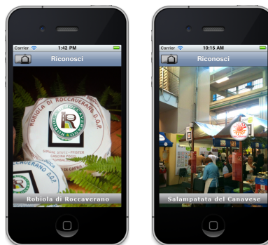
Fig. 2. Logo framing

With our approach we want to offer users an interaction modality which uses a mobile phone camera and is, on the one hand, natural, quick and immediate and, on the other hand, closely related and immersed into the surrounding environment. Interaction takes place in augmented reality mode where real world live images are enriched with information related to the identified object (Figure 2).