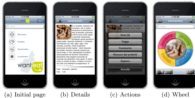
Fig. 4. User interface

Apart from framing a product label with the phone camera, the user can start from a GPS position, a textual search or from a bookmarked or a randomly selected item, figure 4(a) shows the application starting page where the user can select the preferred input modality to begin the exploration of the gastronomic domain. In addition, it is possible to explore the social network of the object (Figure 4(d)) with an innovative interaction model based on the metaphor of a wheel . This novel interface makes it possible to visualize the recognized object with some related items around it and the relationships linking them to the object in question (the description of the application interface is not the subject of this paper, for more details see [1, 3]).