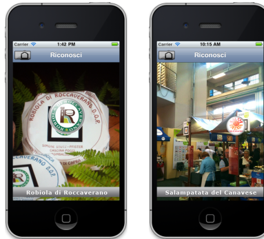
Fig. 2. Logo framing

With our approach we want to offer users an interaction modality which uses a mobile phone camera and is, on the one hand, natural, quick and immediate and, on the other hand, closely related and immersed into the surrounding environment. Interaction takes place in augmented reality mode where real world live images are enriched with information related to the identified object (Figure 2).